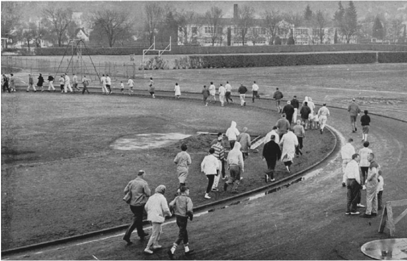
Figure 3. Eugene Joggers University of Oregon, early 1963.