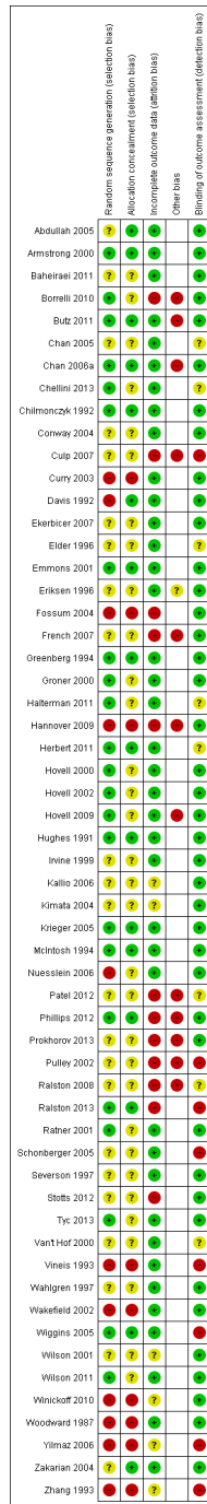
Figure 1. Risk of bias summary: review authors' judgements about each risk of bias item for each included study.