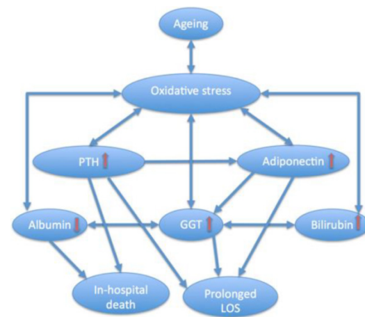
Figure 3. Diagram illustrating complex interplay between ageing, oxidative stress, parathyroid hormone (PTH), adiponectin and gamma-glutamyltransferase (GGT) and other hepatic markers and their relation to short-term outcomes in older patients with hip fracture. LOS, length of hospital stay. In advanced age, GGT, albumin, bilirubin, adiponectin and PTH, all of which are influenced by oxidative stress, may exert both protective and promoting effects on oxidant formation, affect each other, and contribute to poor outcomes. Excessive PTH along with different other age-related factors drives adiponectin levels higher, and such elevations increase GGT activity which reflects an integrative adaptive/compensatory or pathological response (homeostatic regulation or dysregulation). In HF patients, both GGT and adiponectin concentrations above the median levels are independent markers of prolonged LOS and contribute synergistically to this outcome, hypoalbuminaemia is associated with in-hospital death, and hyperparathyroidism is an independent predictor of both fatal outcome and prolonged hospital stay.

In regard to our observations, age-related decrease of GGT activity may reflect the decline not only in liver function, but in the whole antioxidant defence system (including the decrease in the antioxidant effects of albumin as one of its components), and the increase in serum GGT level may be a compensatory response to oxidative stress, a recognised hallmark of ageing and chronic diseases. This response includes increases in PTH and adiponectin. The former is at least in part responsible for the adiponectin elevation, while the later enhances the anti-oxidant potential in the cells by increasing GGT and promotes apoptosis. 225 In this way, it can be hypothesized that in our patients, higher GGT activity which is positively associated with both adiponectin and bilirubin (also a potent antioxidant) levels, reflects a compensatory response to oxidative stress. However, in the setting of advanced age and co-morbidities this response is unable fully counter-regulate the oxidative damage and prevent its progression if oxidative stress increases, as in the perioperative period. Indeed, in our cohort, both GGT and adiponectin above the median levels were independently and synergistically associated with prolonged LOS, but not with in-hospital mortality, whereas even mild decrease in albumin concentration, an important extracellular antioxidant, demonstrated a strong relation to fatal outcome. These complex interactions are summarised in Figure 3.