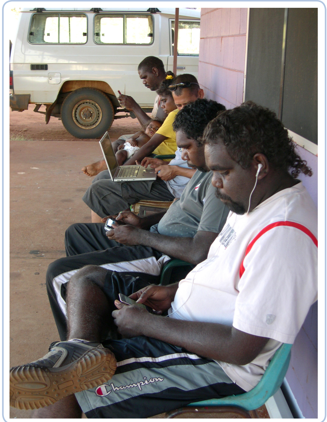
Fig. 4. 'Plugged in'—youth participants at a workshop for the Australian Research Council Linkage Project, March 2009

For further explanation of this research project see Kral 2010.