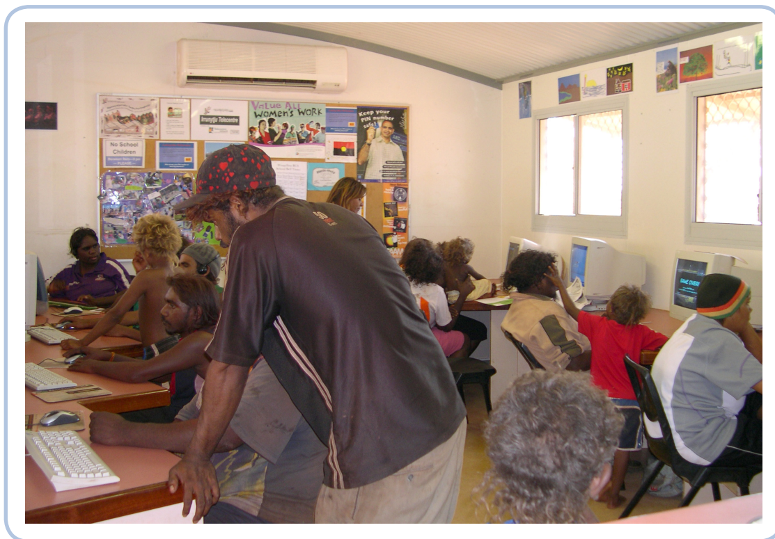
Fig. 1. Young people using the Telecentre at Ngaanyatjarra Media, Wingellina