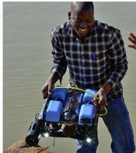
A local team received a training on how to operate the drone, the sensors and the VR headset (on top

The Indymo underwater drone is equipped with a Caddisfly sensor that registers physico-chemical and bacteriological pollution indicators from the water. The sensor is connected to a smartphone app and can be used from the side of a boat.