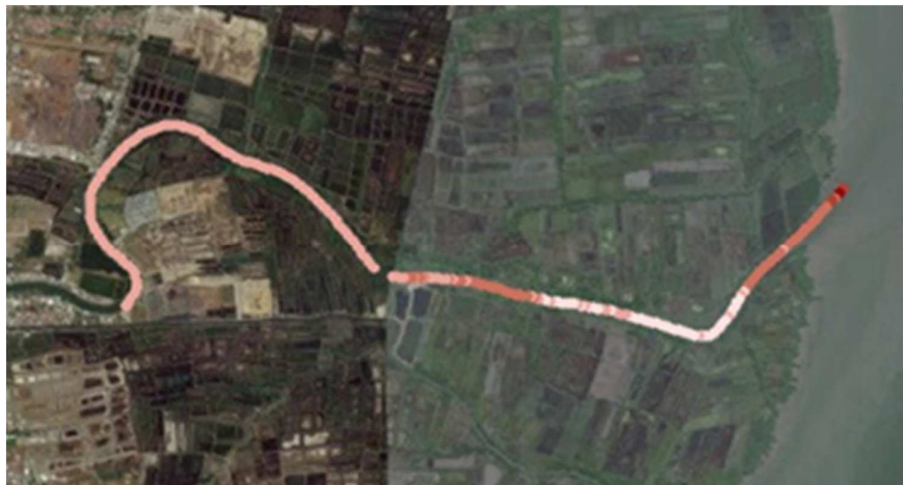
Figure 2 – Salinity gradient over a water stream collected with underwater drone