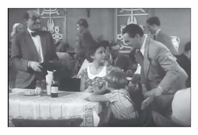
Il. 1. Irena do domu , dir. by Jan Fethke. A restaurant interior. On the walls: ethnic motifs, characteristic of the 50s. These motifs are also visible on the tablecloth that covers the table