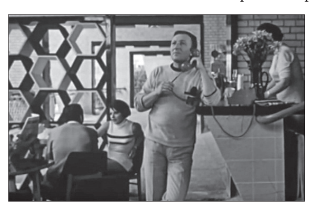
Il. 6. Człowiek z M-3 , dir. by Leon Jeannot. The end of the 1960s. The bar of a luxury tennis club where Tomasz played

the bar equipped with a characteristic screen made of bicolored, trapezoid-shaped empty panels dividing the space into two parts, yet in such a way that the parts still constitute one room (il. [6]).