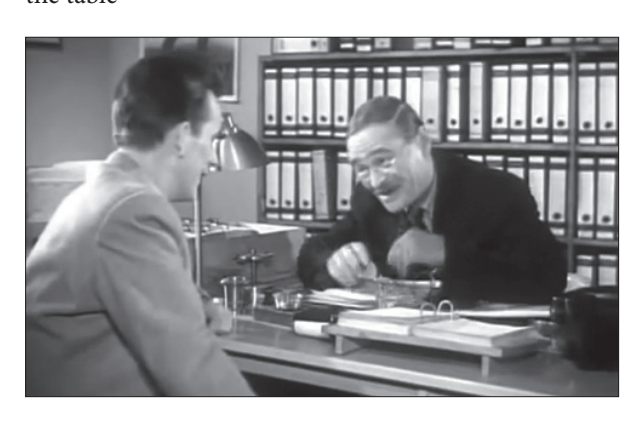
Il. 2. Sprawa do załatwienia, dir. by Jan Rybkowski and Jan Fethke. The 1950s. public interior. City of Warsaw

a characteristic pine sideboard with glass-panelled upper section painted in white oil paint, and a square or rectangular (hardly ever round) wooden table. The interior of a restaurant shown in the aforementioned film has equally unimpressive furnishings. The main decoration are folk-themed ornaments on the walls and their miniature replicas on the cloth covering the table, where the film's main character, Irena, sits with her family (il. [1]). In a slightly different way the film's scenographer presented the cloakroom in Irena's son's kindergarten.