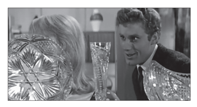
Il. 9. Małżeństwo z rozsąd-ku , dir. by Stanisław Bareja. The end of the 1960s. Polish crystals and popular Kowalskis' wall unit furniture

main characters of the [1961] film Breakfast at Tiffany's live in a very modern apartments. At the centre of Holly's living-room there is a very original sofa resembling a bathtub with a battery attached to the backrest. Mrs. Golightly's kitchen is also very modern, with simple cabinets made of lacquered white plywood and luxury household appliances (toaster, coffee machine, kitchen aid, gas cooker and fridge).