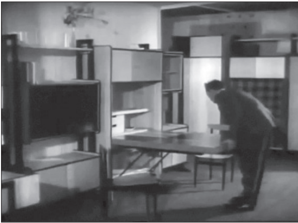
Il. 3. Polska Kronika Filmowa : a source of information about technology – interiors and meble Kowalskich