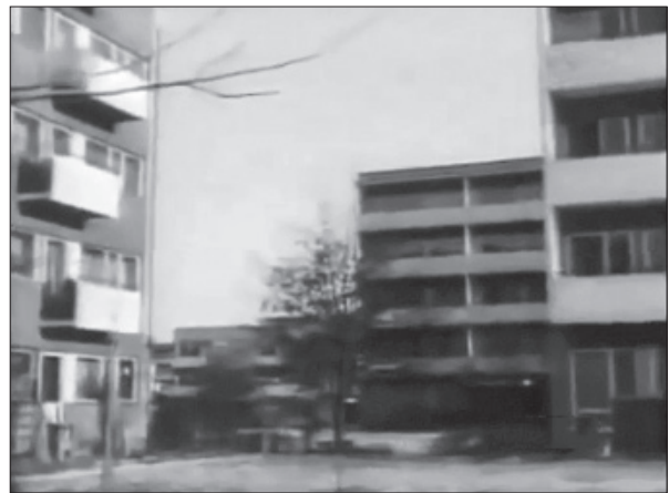
Il. 2. Polska Kronika Filmowa : recreation of spatial phenomena – space and ambience in housing projects in Warsaw

The second option relates to the studying of the techniques and technologies used in the post-war period. It should be noted that, from its very beginning, the Polska Kronika Filmowa eagerly documented all