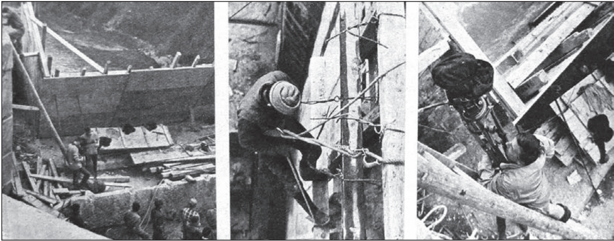
Il. 3, 4, 5. Energia , Władysław Ślesicki.

with a commentary: it will not be a report on construction works.” [9] Such was the idea from which the film impression with a deliberate dramaturgy and poetic creation of moods was born.