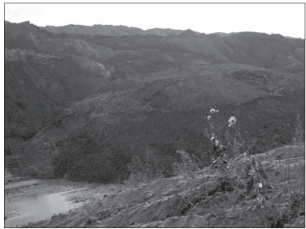
Il. 1. Czas przemiany , Andrzej Piekutowski.