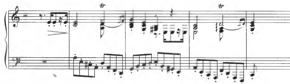
Example 3. Lyon , b. 46-49

numerous modulations, strong chromaticization, changes in the tempo and register of the instrument, and irregular rhythmic groups with unevenly placed accents. Reprise (bars 117-151) begins with T_2 , and the themes undergo further processes of transformation. The first theme is presented in two variants: one more complex in terms of texture and the other reduced, in piano dynamics, sotto voce . The coda (bars 151-187) sums up the piece, in which the elements of the two main themes recur, overlapping each other.