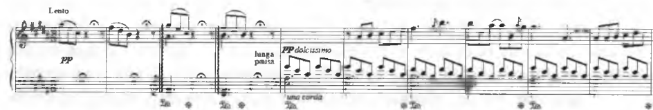
Example 4. Les cloches de G***** , b. 1-10

In Les cloches de G***** Liszt once again fits in the context of 'water' pieces by means of the poetic quotation preceding the score and the application of barcaroles in the middle part. The piece opens with the motifs of bells, and only after this the proper melody line is to be heard; in the beginning the melody line resembles M_2 from Lyon (fragment from Schubert's Erlkönig ; ex. 4). The element which binds the piece together is the motif of the Geneva bells, but what is even more important, frequently combined with M_2 from Lyon (a symbolic union of the two cities?). It is not always easy to grasp while listening due to the changes of tempo and texture. Nevertheless, in the piece there are fragments where it is quite simple, as, for example, at the beginning of the part un poco agitato (bar 60 and the following; ex. 5): after M_2 from Lyon the motif of bells appears, frequently repeated in different registers of the piano, which creates the effect of an echo (orchestra trope).