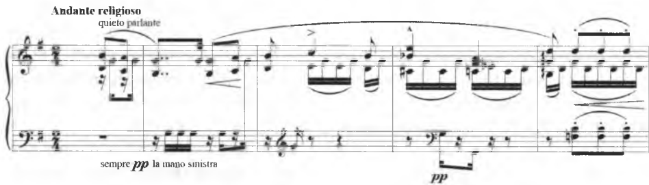
Example 4. Harmonies poétiques et religieuses , b. 63-67

The third theme ( T_3 ) is a variation of T_2 ; however, changes in texture, wording, the religioso character and tempo marking quieto parlante , as well as tonal (G major) and metric (2/4) stabilisation make it possible to perceive this structure as another theme (Ex. 4). This very peculiar mode of elaboration of theme, which consists of changing the meaning (here grief is transformed into religious ecstasy) will become one of the distinguishing features of Franz Liszt's style.