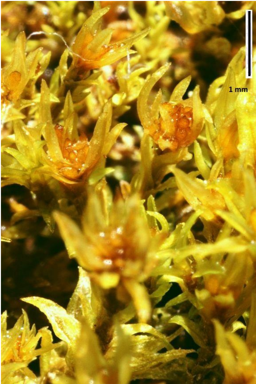
Figure 1. Barbula crocea (Brid.) F. Weber & D. Mohr, habit.