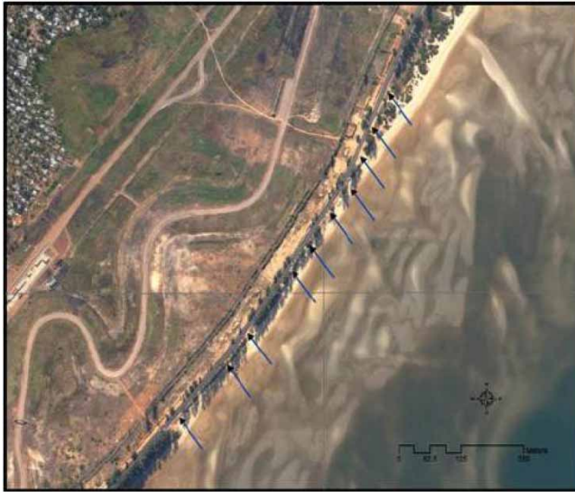
Figure 3. Points of Marginal Avenue susceptible to be affected by the erosion processes linked to the sea level rise effect.