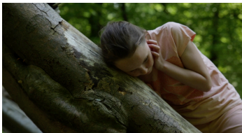
Figure 5: Users can experience a hidden auditory world within the trunk of the tree, with help from surface transducers.