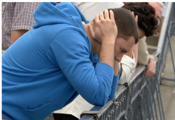
Figure 1: A man listening to Touched Echo . Photo by Markus Kison from www.markuskison.de . All rights to the artist.

A prominent example of interactive installation design with surface transducers is Markus Kison's Touched Echo [9]. The installation takes the user back to the air raid of the German city Dresden at the end of WWII. With a view of the now rebuilt city, users can gain access to a soundscape of the bombings via a sonified metal banister. Transducers vibrate the sound directly into the banister hiding it in the metal. Users can only access the recordings by positioning the elbows on the banister and covering their ears with their hands, making the sound travel through the bone in the lower arms via bone conduction.