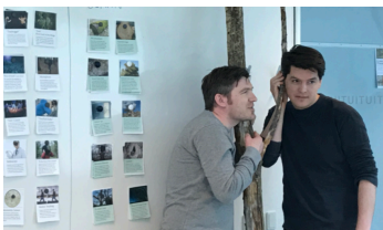
Figure 6: A smaller scale implementation of the project adapted to be used indoors, which is how we would demo the installation at DIS.

and the woods in general at a higher level. The Living Tree is thus about expanding our knowledge about trees by creating a multi-sensuous and affectively engaging experience that lets people explore how trees are not only resources, but living creatures with personality, character and expression.