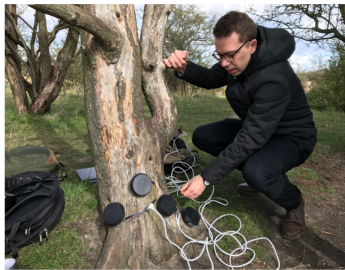
Figure 3: Testing surface transducers on an actual tree in the wild.