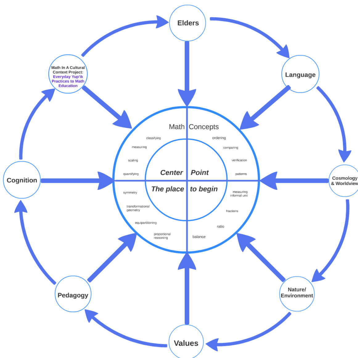
Figure 2. Ethnomathematic Research Framework in a Yup'ik Context

elements guiding this research are: Elders, language, cosmology and worldview, nature/environment, values, pedagogy, cognition, and the MCC project methods. Math concepts identified by MCC surround the Center Point, the place to begin.