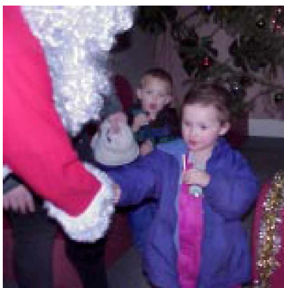
Holiday party in Sitka.

Sitka Student Government held a potluck holiday party for faculty, staff, students, and the general public on Dec. 3. There was food, games and a chance for children to talk with Santa.