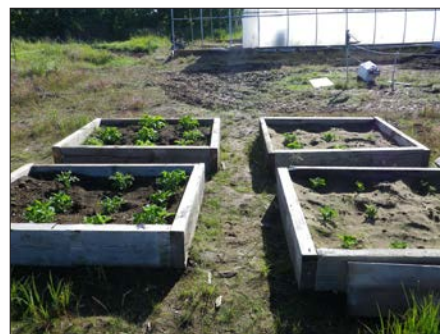
Notice the contrast between (left) sandy soil augmented with peat moss and fish compost including wood chips, and (right) untreated sandy soil typical of western Alaska. These garden plots are in Naknek.