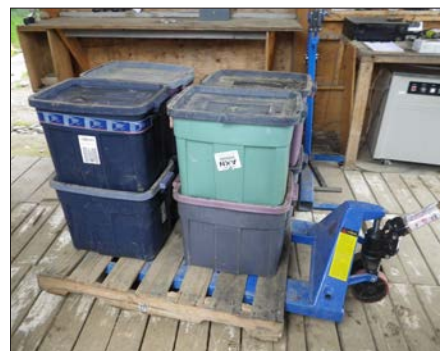
Make sure your fish waste is well-contained. Plastic totes with lids work well.

If you have the correct ratio of carbon to nitrogen and the right level of moisture, your fish waste composting could be finished in as little as a few months. However, you will want to cure the compost for several months or more, possibly over winter, to ensure that the compost is fully decomposed. Additionally, unfinished and uncured fish waste compost will have a lot of persistent undecomposed material from fins, tails, and skin, which will invite fungal growth, including mushrooms, if applied to the garden. Mushroom growth is a sign that the soil has mycelium, which is the vegetative part of a fungus, a mass of branching, thread-like hyphae. Adding unfinished compost may increase your plants' susceptibility to mold and rot, so you may want to hold off on applying the compost for several months, or even until the next growing season.