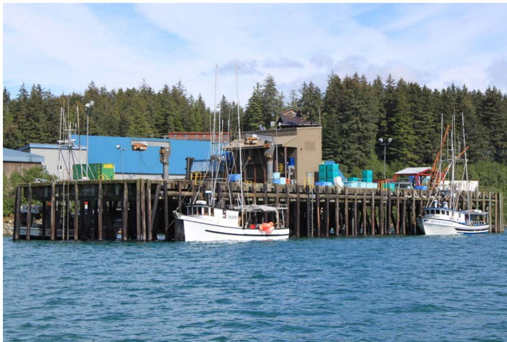
Salmon trollers at Yakutat, Alaska.

Members of the public can also present oral testimony in person at each Board meeting for which they have an interest, as well as in the committee process developed by the Board for gaining more in-depth information in an information setting. Information on how to testify in person can be obtained through the Boards website, http://www.adfg.alaska.gov/index.cfm?adfg=process.main . ■