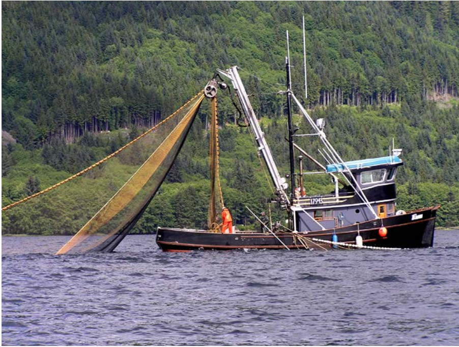
Purse seiner in southeast Alaska.

members of the Board of Fisheries, subject to confirmation by a majority of the members of the legislature in joint session. The members serve staggered terms of three years and are appointed based on their “interest in public affairs, good judgment, knowledge, and ability in the field of action of the Board, and with a view to providing diversity of interest and points of view in the membership.” 3 Residency is a requirement for Board membership and members are to be appointed without regard to political affiliation or geographical location of residence within the state. The commissioner of the Alaska Department of Fish and Game (ADFG) is considered the ex-officio secretary of the Board, but is not a member of the Board.