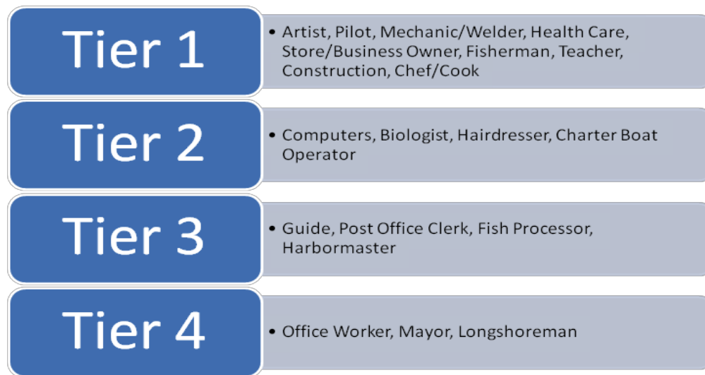
Figure 3 Coastal youth Occupational Ranking

In analysis, the data were stratified by group as a whole, by community, by gender, by ethnicity, and by sub-region. For the group as a whole, findings demonstrate a cultural affinity toward outdoor and/or vocational work, such as fishing, mechanics, carpentry, air piloting, and culinary arts, but also other self-directed work such as teaching and owning a small business. Occupations with lower ranks were perceived to be associated with a lack of personal power or boring, including: fish processing and office work. Jobs in tourism were also given a low ranking as well as mentioned previously, and work in local government was generally undesirable due to youth recognition of the heady nature of small town politics. This analysis also revealed gender differences and a marked cohesion among young women in their answers although their comments about work during the group discussions were often overshadowed by interests and preferences of the young men in the group, i.e. in which the young men overwhelmingly wanted us to know their interests did NOT include hairdressing.