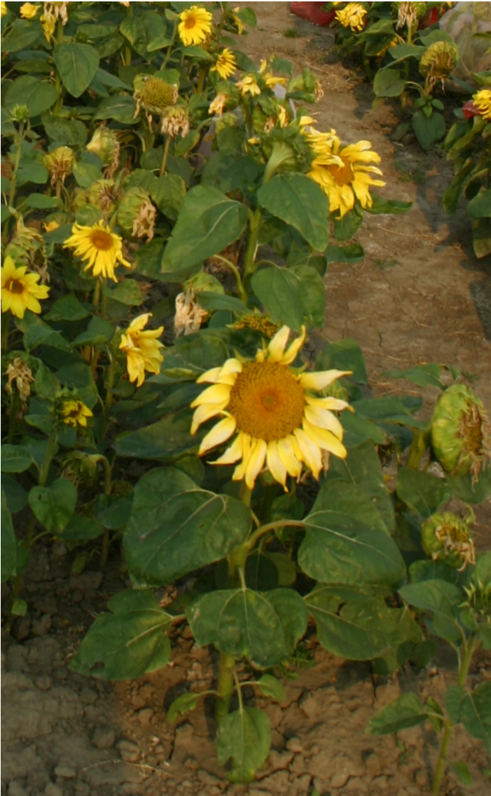
'Midnight Sun-flower' oilseed sunflower, in fields at the Fairbanks Experiment Farm.