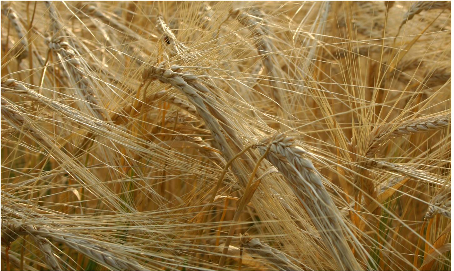
'Sunshine' hulless barley.