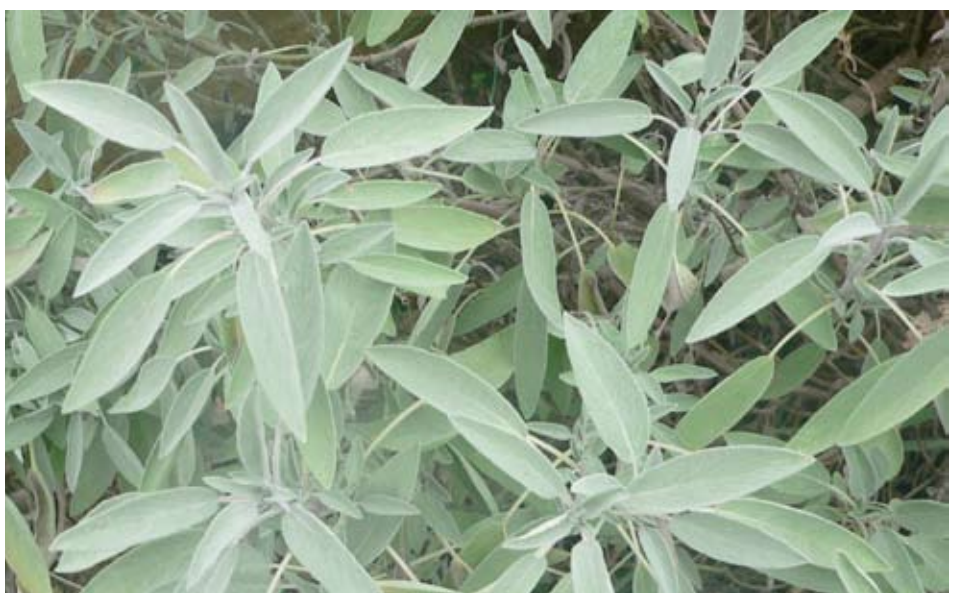
Salvia officinalis, or culinary sage.