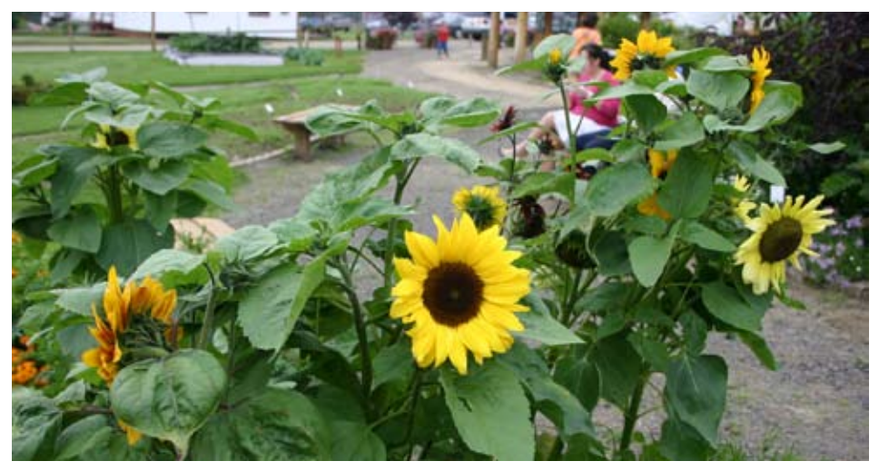
Helianthus annus, or sunflowers, growing in the Georgeson Botanical Garden.

All America Selections, Flower and Vegetable Seeds Goldsmith Seeds, Flower seeds Kieft Seeds, Flower seeds PanAmerican seeds, Flower seeds Risse Greenhouses, Plants and supply discounts USDA Plant Introduction Stations, NC7, Iowa State Univ., Plants and seeds