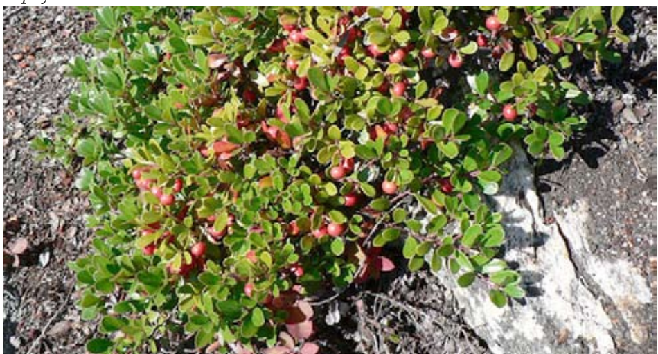
Arctostaphylos uva-ursi, or kinnikinnik.

The University of Alaska Fairbanks is accredited by the Commission on Colleges and Universities of the Northwest Association of Schools and Colleges. UAF is an affirmative action/equal opportunity employer and educational institution.