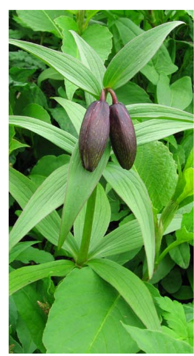
Fritillaria camschatcensis, or chocolate lily.