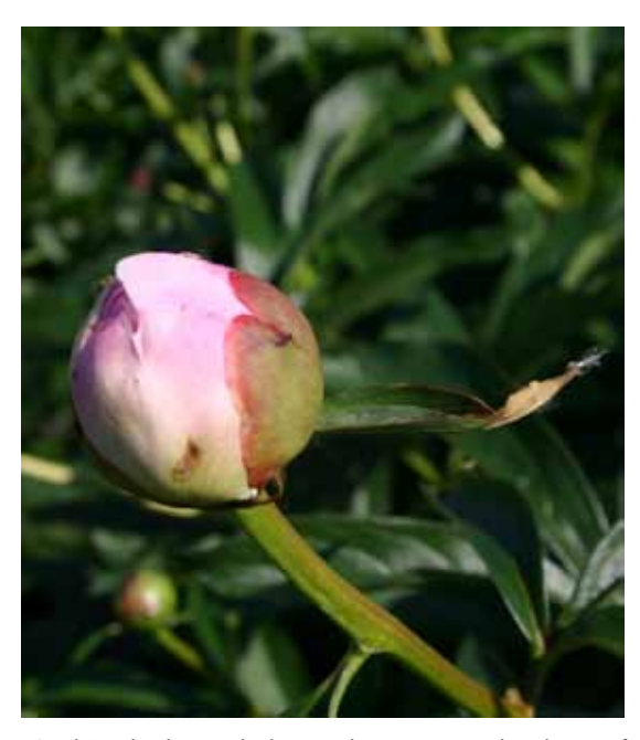
Sarah Bernhardt peony bud. Research into commercial production of peonies, variety suitability, and marketing of Alaska-grown peonies is conducted at the Georgeson Botanical Garden on the Fairbanks Experiment Farm.

There are 350 varieties of flowers and 150 vegetable varieties grown at the Georgeson Botanical Garden each summer.