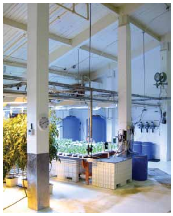
A view of the interior of the Controlled Environment Agriculture Laboratory.