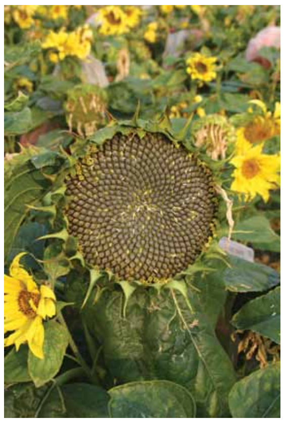
Midnight Sun-flower at the Fairbanks Experiment Farm. In the photo at left, one can see that some heads have been covered with mesh bags to prevent birds from eating the seed.

About half of the dried weight of sunflower heads is seed. The whole seed contains about 24 to 45 percent oil. Only about 20 to 35 percent oil can actually be expressed from the whole seed. Sunflower oil is obtained by a combination of expressing and solvent extraction. The remaining oil cake meal contains about 35 percent protein, which is used as a livestock feed. Sunflower oil is mostly polyunsaturated and is used in the edible oil market. It also is a semi-drying oil that is used in the manufacture of soaps and paints. Whole oil seed is used as a feed for poultry and caged and wild birds. Confectionery seeds are either eaten raw or roasted. In Alaska, oilseed sunflowers have been grown on limited acreages off and on for many years, primarily as livestock forage and secondarily as oil and confectionary seed for the local birdseed market.