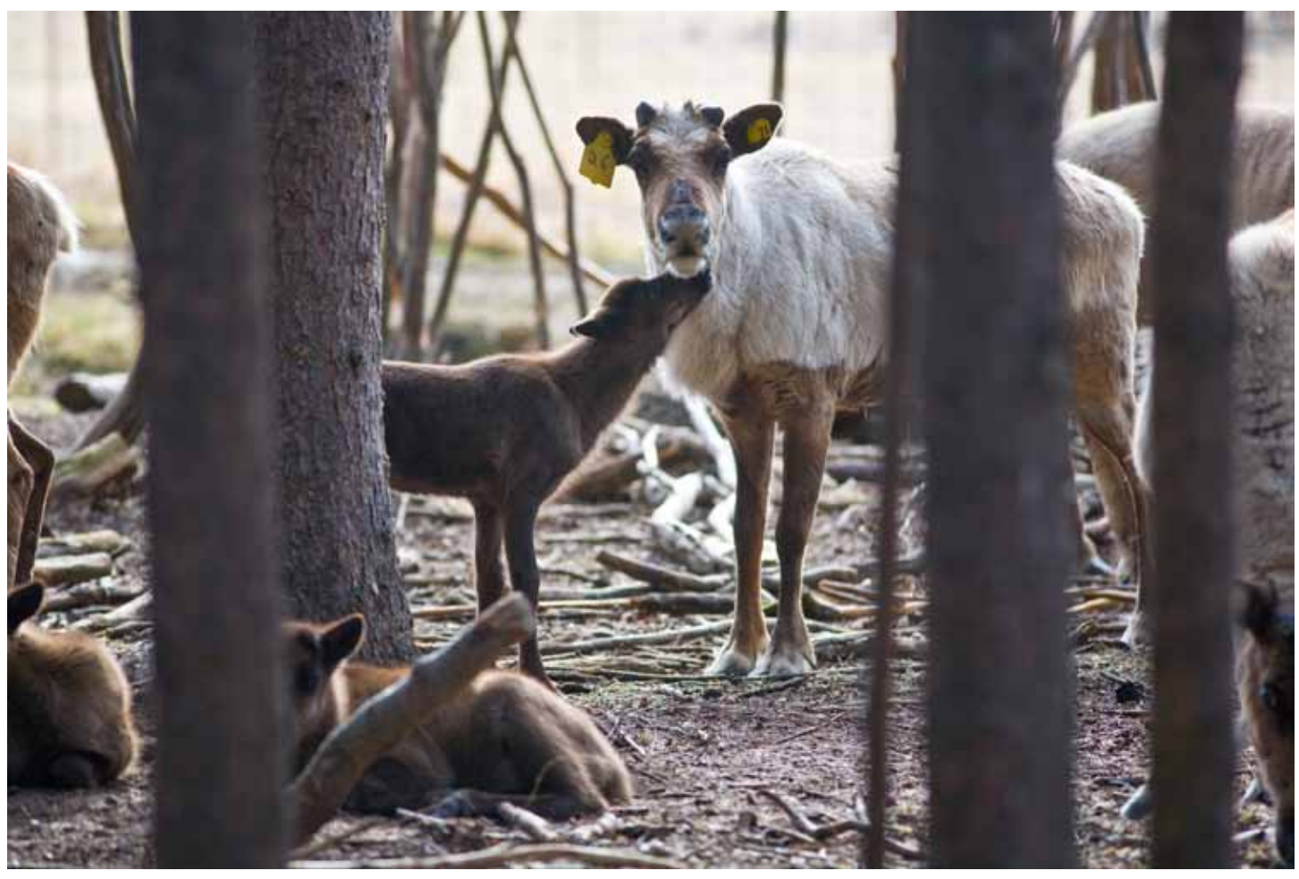
Reindeer cows and calves at the Fairbanks Experiment Farm.

Schoolchildren across the nation help name the reindeer born at the farm.