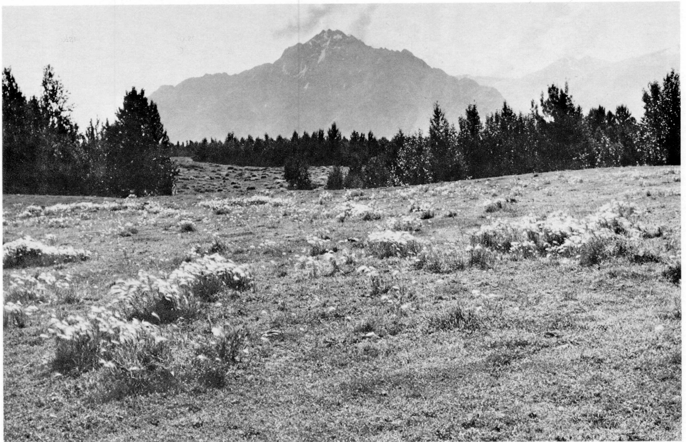
This semipermanent pasture shows differential utilization of palatable and unpalatable grasses by grazing cattle. Palatable grasses such as Kentucky bluegrass, shown in the foreground, have been heavily grazed, while the equally available but unpalatable weedy grass called foxtail barley, shown here in scattered clumps, has not been grazed. This permits it to grow tall, produce seed heads, and eventually mature seed, if it is not clipped shortly after seed heads appear to prevent it from spreading further.