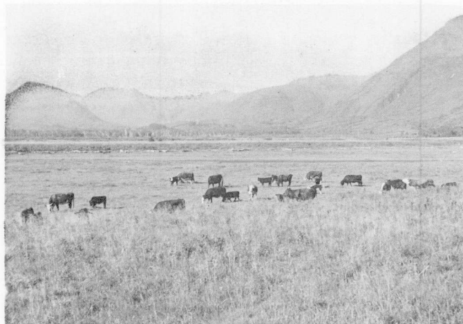
Kodiak Island (above) and other islands to the south and west are mantled with mixed vegetation including numerous grasses. The milder winter climate there permits virtually yearlong grazing and less dependence on harvested and stored forages for winter feeding than on the mainland.

stock manager—who is often the same person. Four of the most important of these characteristics, all of which are interrelated, are adaptation (especially concerning winter-hardiness of perennials); yield ; quality ; and palatability . Each can be influenced by several factors, and each can be further subdivided into contributing components.