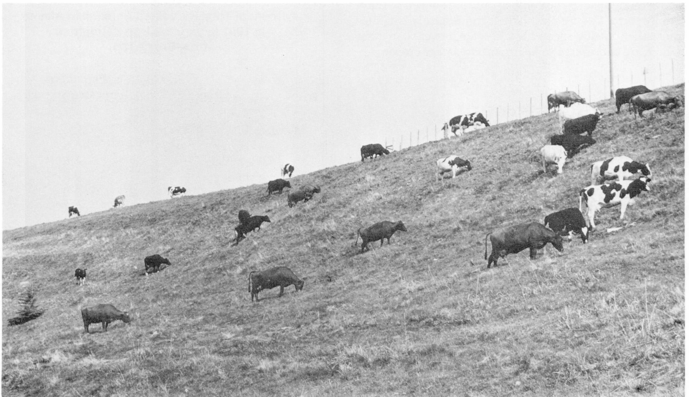
Sod-forming perennial grasses can be established on lands that are too steep or otherwise unsuited for tilled croplands. As on this permanent hillside pasture, such grasses provide an erosion-proof vegetative cover

Several characteristics of forage crops are of major importance to the Alaskan forage grower and the live-