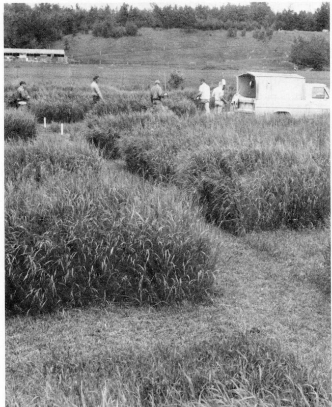
Smooth brome grass is Alaska's most dependable and widely used perennial forage grass seeded on rotational croplands and pastures. Northern-adapted varieties serve well for hay, silage, green-chop, or pasture. Experimental studies, as shown above, determine productivity, quality, and persistence of brome grass on various harvest schedules.

The perennial grasses most commonly seeded in Alaska are smooth brome grass and timothy. The follow-