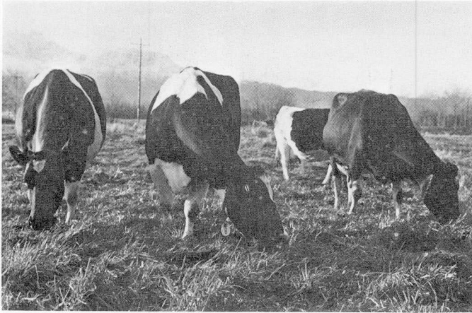
High-producing dairy cows require a year-around, abundant supply of palatable, nutritious forage. The summer grazing season can be extended into autumn by use of tetraploid annual ryegrass, as shown being grazed by cows on October 7.

herbage quality and feeding value when it is at leafy stages of growth, which last until the occurrence of hard frost in October. Perhaps the best way to use this grass in Alaska is to seed it in spring with another annual forage such as oats, oats-peas, or oats-barley. With early planting and early harvest of the cereal forage, a sufficient portion of the growing season remains for the annual ryegrass to regrow to provide a good late-season pasture or green-chop (50). Some dry hay should be fed to avoid a diarrhea effect that occurs when ryegrass is consumed alone. After heading, annual ryegrass rapidly becomes stemmy and less desirable as a forage, particularly to grazing stock (5).