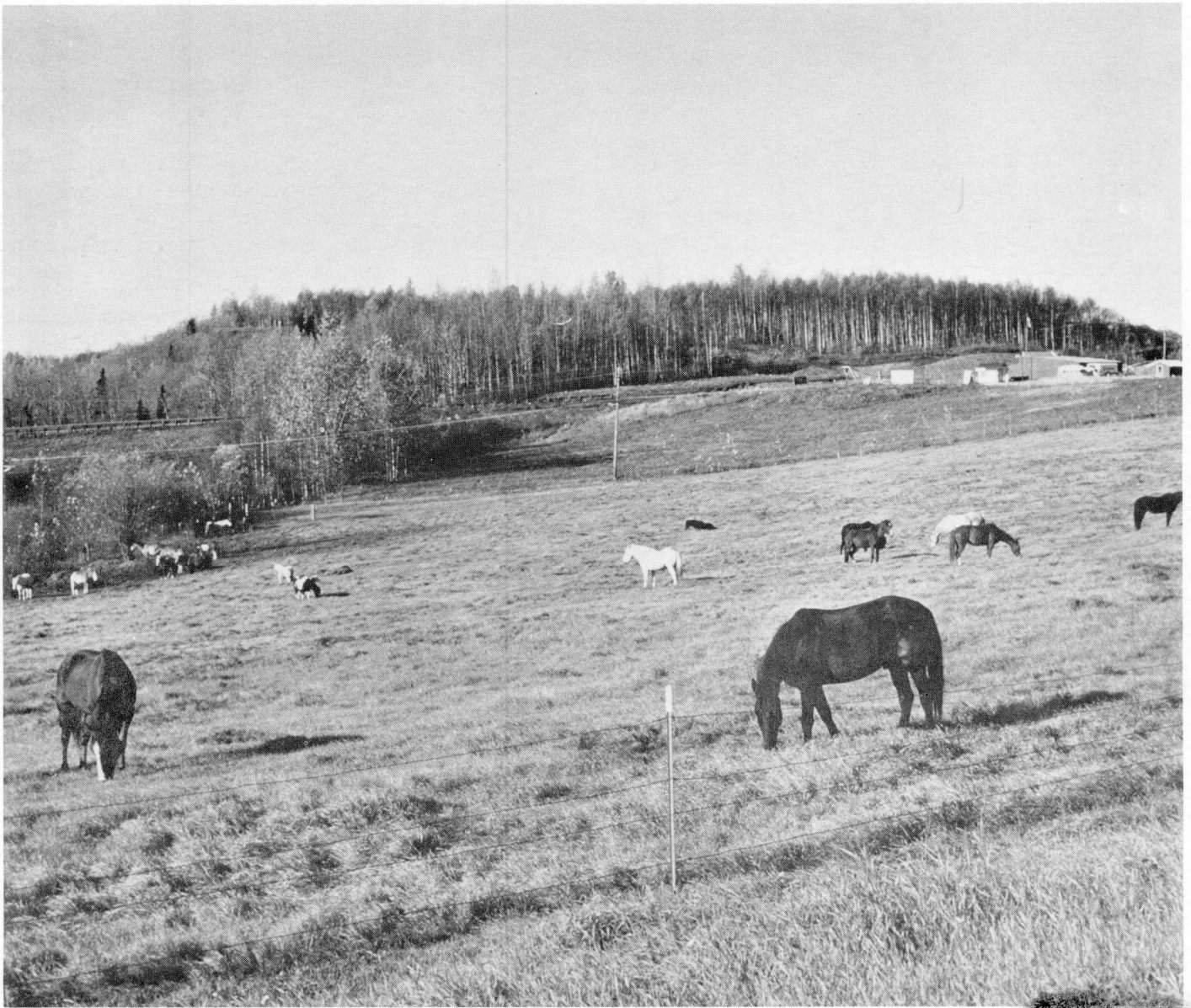
Pleasure horse numbers continue to grow in Alaska, increasing the need for horse pastures and hay for winter feeding.