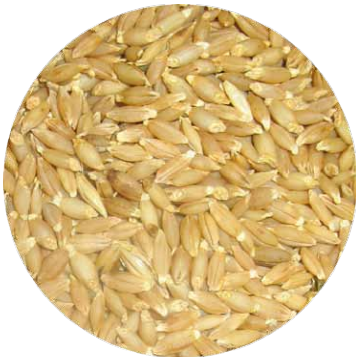
Hulless barley grains.