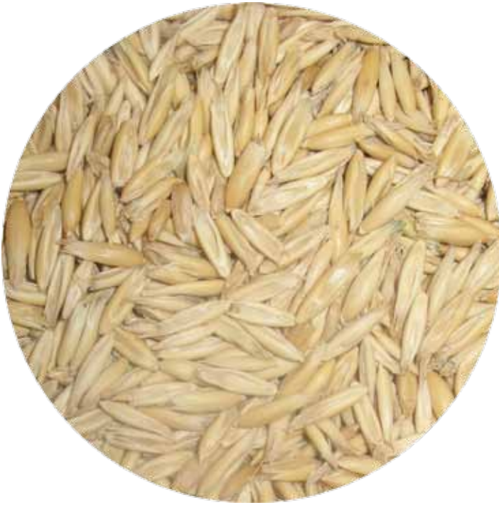
Yellow feed oats.

To be consumed by humans, hulled oat varieties must be dehulled first. The dehulling process differs slightly from dehulling barley because oats are higher in lipids (fats) than all other grains. This can cause the abrasion wheel to plug up and not be completely effective. An oat dehuller functions by dropping the hulled oats inside a large spinning closed container that encloses another spinning stone. On contact with this stone, the hulls are separated from the groats (the inside portion of the oat kernel). The lighter hulls are then blown off and the dehulled groats are collected. As with dehulled barley, oats can be pearled.