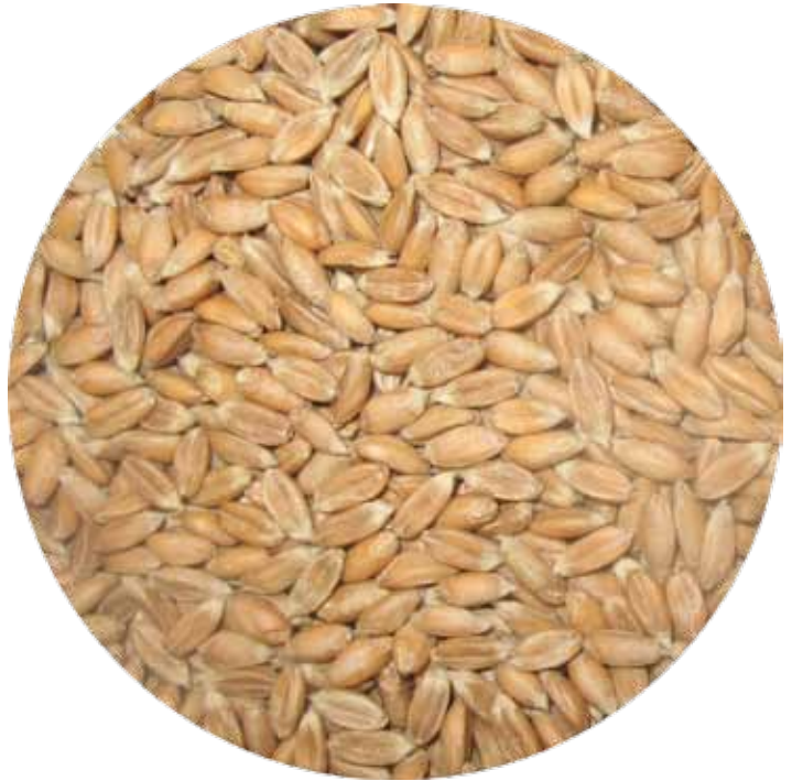
Spelt wheat, debulled.