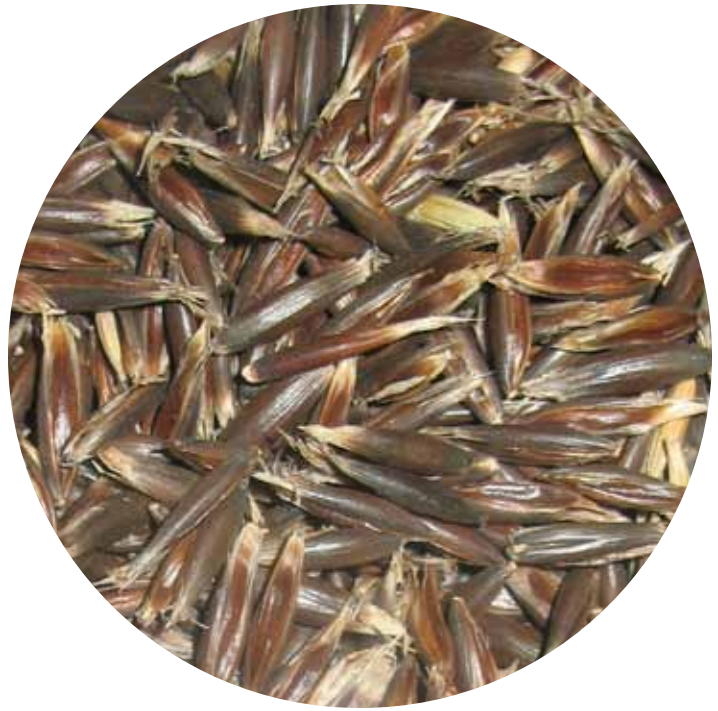
Black feed oats (Avena strigosa L.).

To be consumed by humans, hulled oat varieties must be dehulled first. The dehulling process differs slightly from dehulling barley because oats are higher in lipids (fats) than all other grains. This can cause the abrasion wheel to plug up and not be completely effective. An oat dehuller functions by dropping the hulled oats inside a large spinning closed container that encloses another spinning stone. On contact with this stone, the hulls are separated from the groats (the inside portion of the oat kernel). The lighter hulls are then blown off and the dehulled groats are collected. As with dehulled barley, oats can be pearled.