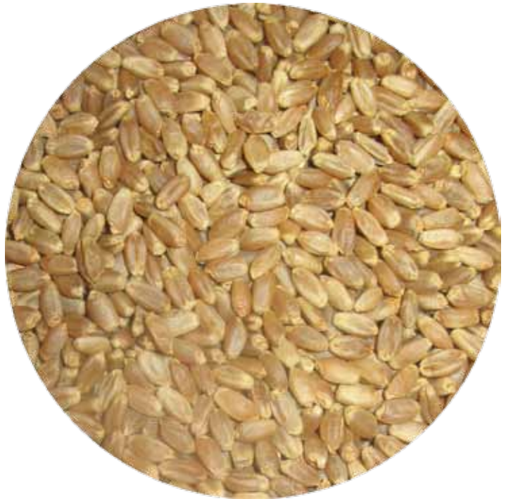
Hard red spring wheat.

endosperm) is preferred for baking confectionary products. Secondary uses for wheat are for non-ruminant animal feed (cracked or rolled), or for poultry diets (whole grain).