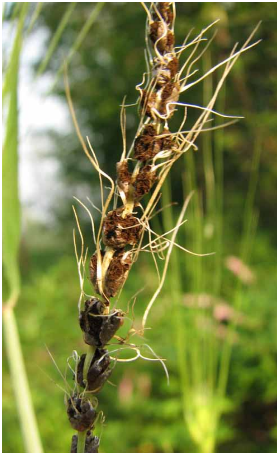
Smut on barley.

Other fungal diseases such as barley loose smut ( Ustilago nuda ), oat loose smut ( Ustilago avenae ) and wheat loose smut ( Ustilago tritici ) form loose, powdery brown masses in place of the seedhead, earlier than normal heads. They are especially prevalent on all hullless grains, wheat, rye, and triticale. These fungal spores are then blown around to infect the forming seed on the rest of the crop. Leaf blotch ( Scolecotrichum graminis )