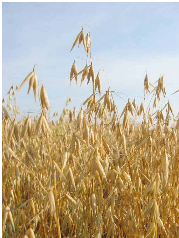
Close-up of ripe oat heads.

Oats ( Avena sativa ) are the second-most important grain crop for Alaska, after barley. They are also well adapted to the long day length and short growing season found here. Oats are 7 to 10 days later in maturing than the early season barley varieties. Oats can be planted early in the season in areas that are poorly drained, as oat seed germinates well in cold and wet soils. Oats are also more tolerant of acidic soils than barley or wheat and can produce high yields when soil pH values range between 5.0 and 5.5. There are many different types of oats; feed oats which include common (or white) oat ( Avena sativa L.), black oat ( Avena stri-gosa L.) and red oat ( Avena byzantina C. Koch), and hulless oat ( Avena nuda L.). Oat straw lacks the rough awns of barley straw so there is a high demand for use as animal bedding, especially with the local dog mushers. Seeds from feed oats have the hulls still attached but the hull from hulless varieties detaches from the kernel when harvested, exposing the embryo and leaving a hulless or naked kernel.