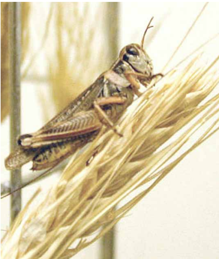
Grasshoppers. From top to bottom: northern grasshopper, Melanoplus borealis ; female migratory grasshopper, Melanoplus sanguinipes ; male migratory grasshopper on barley head.