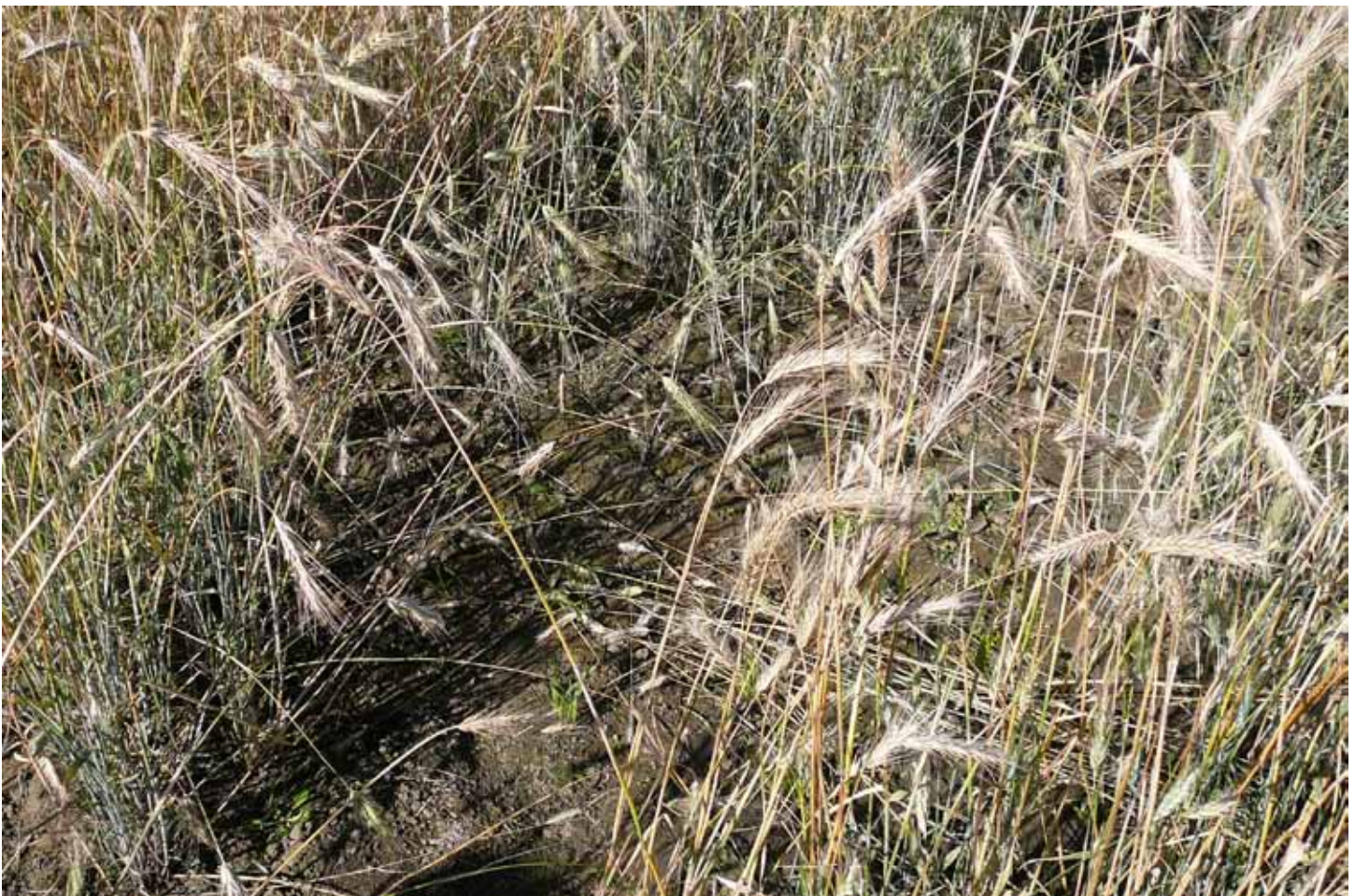
Bebral winter rye.