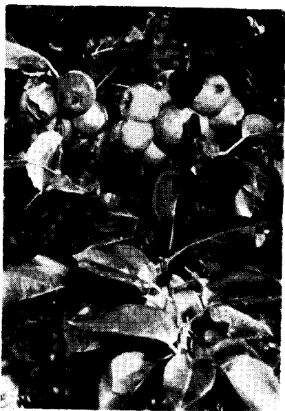
Jacques crab apple

JACQUES originated at the Experimental Station, Rosthern, Saskatchewan and is described as three-fourths apple. It is an annual bearer. It has been on test at Matanuska since 1951 without showing the slightest trace of winter injury. Tree very vigorous, distinctive in its very upright type of growth. Branches long, slender but with stiffness characteristic of Malus baccata . Fruit oblong-conic, 1½ inches across by 1¾ inches in depth, sometimes slightly ribbed; yellowish-green washed with dull red, frequently spotted with dull