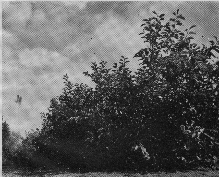
Common chokecherry has possibilities as a fruiting shelterbelt