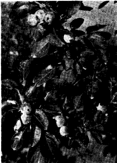
Adam crab apple fruit