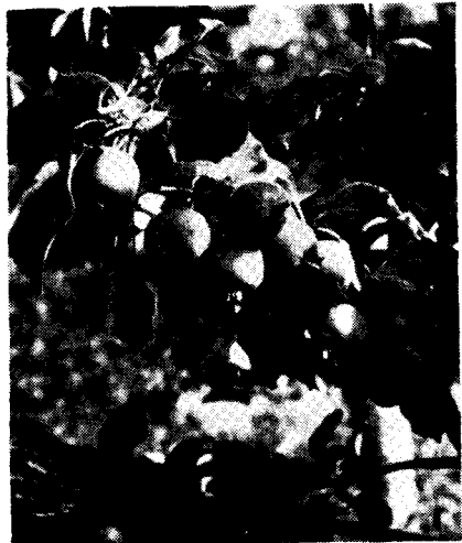
Anaros crab apple

quality fair to good and by some considered to be of dessert value, fine for canning or jelly. Ripens in early September and is rather persistent on the trees.