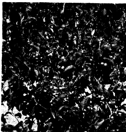
Osman crab apple

OSMAN originated at the Experimental Farm, Ottawa, from a cross of Siberian crab x Osimoe made in