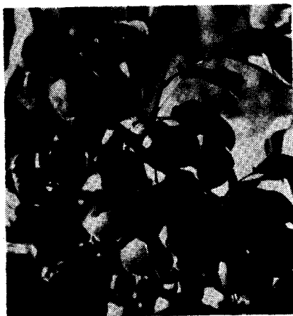
Rescue crab apple

RESCUE originated about 1936 at the Scott Experimental Station, Scott, Saskatchewan as a seedling of Blushed Calville. On trial at Matanuska since 1951 and has shown only a very moderate amount of winter injury. Tree moderate in growth, open or spreading. Fruit small apple or large crab, 1½ by 1½ inches or globular; greenish yellow washed with dark red at maturity; flesh yellowish white, firm, sweet, subacid to sweet, free from astringency; quality good; flavor excellent. Ripens in late August or as early as any crab tested. Because of its profuse white bloom and showy red fruits in the fall, this may be con-