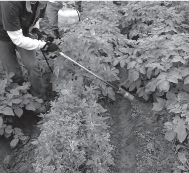
Flame weeding controls weeds within the potato row and on the sides of raised potato beds.

roots will minimize damage to the developing tubers while effectively killing the weeds. Using a chopping action to remove the weed roots or pulling entire weeds by hand can damage the tubers.