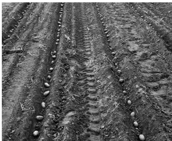
Seed potatoes can be planted in furrows (above) or mounds.

successful gardeners pay no attention to seed piece orientation in the soil.