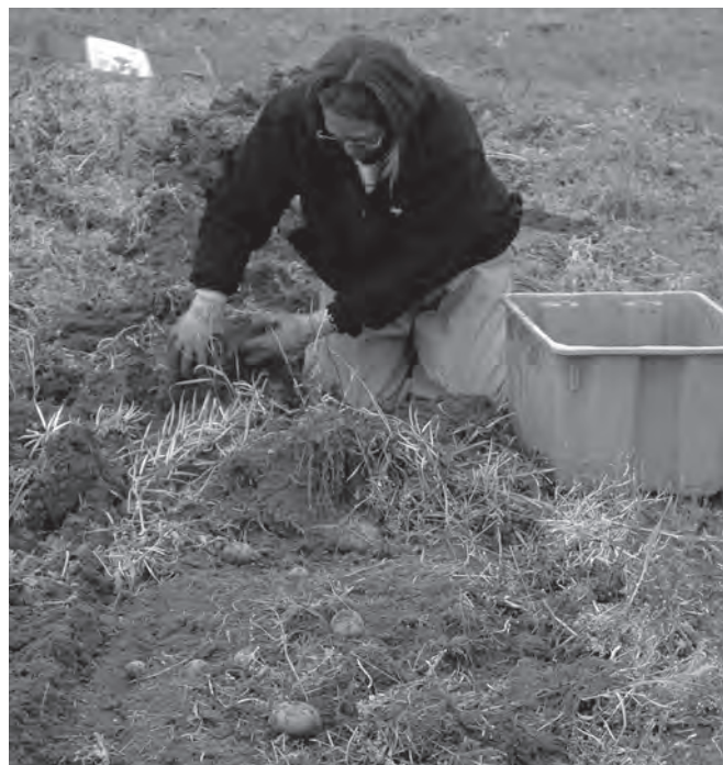
Potatoes can be harvested both during the growing season and at the end of the growing season.

Single drop seed pieces are small potatoes, 1 to 2 inches in diameter, which are planted whole. Some gardeners will pay a premium for single drop potatoes because they do not need to be cut be-