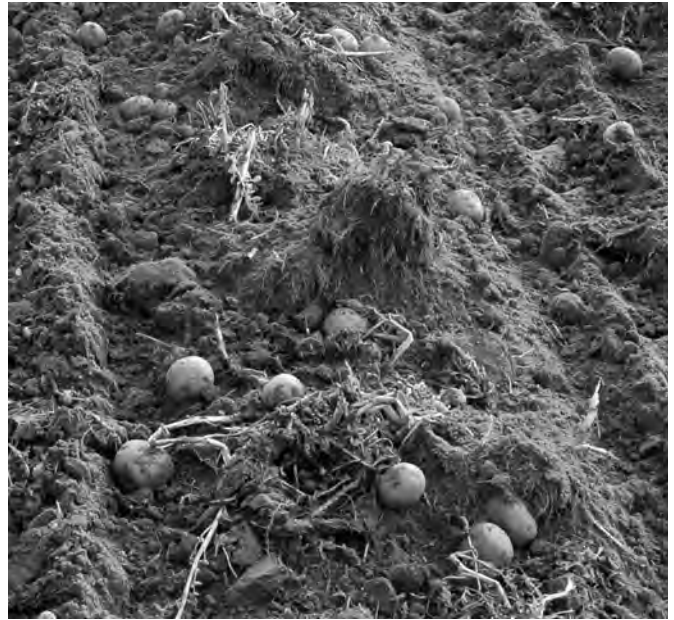
Cutting back the vines one to two weeks before harvest allows the potato skin to toughen before storage.

While the optimal storage condition for potatoes is a dark, cool, high humidity area, most homes are not equipped to meet the exact storage standards used by commercial producers. Simply storing