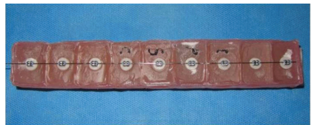
Fig. 3: Mounted disks for bracket bond strength testing.