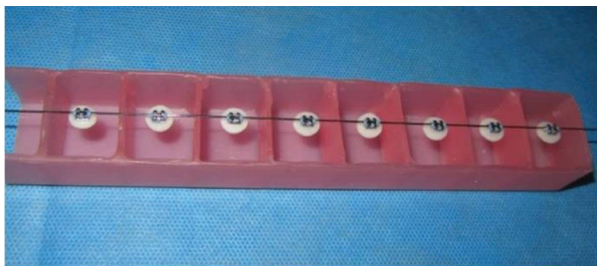
Fig. 2: Wax boxes with wire ratchet for mounting the disks.