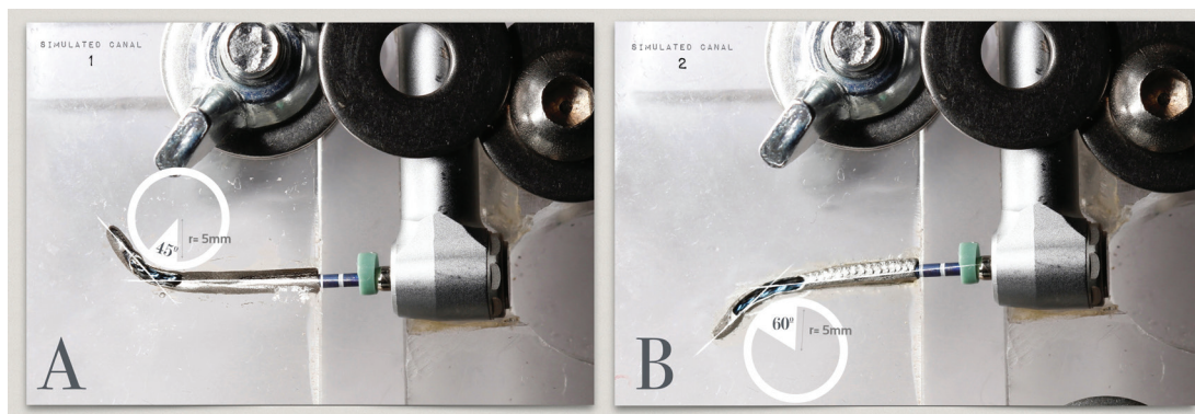
Fig. 1: The 2 artificial canals. Canal 1 (A), 45° angle and 5-mm radius; canal 2 (B), 60° angle and 5-mm radius.

Instruments were rotated in an electric motor (X-Smart, Dentsply Maillefer, Ballaigues, Switzerland) using a conventional rotary motion with a handpiece reduction of 16:01, with a constant speed and torque recommended by the manufacturer of 300 rpm and 5.2 N/cm for PTN and PTU, and 500 rpm and 2.8 N/cm for PVB. The working length was standardized to 19 mm for all files. To reduce the friction of the files with the metal canals walls during conducting the test and minimize the release of heat, lubricant oil (Millet-Franklin, BA, Argentina) was applied within the artificial conduits before each use. All instruments were rotated until fracture occurred. The time until failure was recorded with a camera attached to a tripod (Canon EOS 600D, Canon Incorporated, Tokyo, Japan) and a digital timer (Timex, Middlebury, CT), stopping as soon as the fracture was detected. Time was converted into the number of cycles to fracture (NCF). By converting to number of cycles to