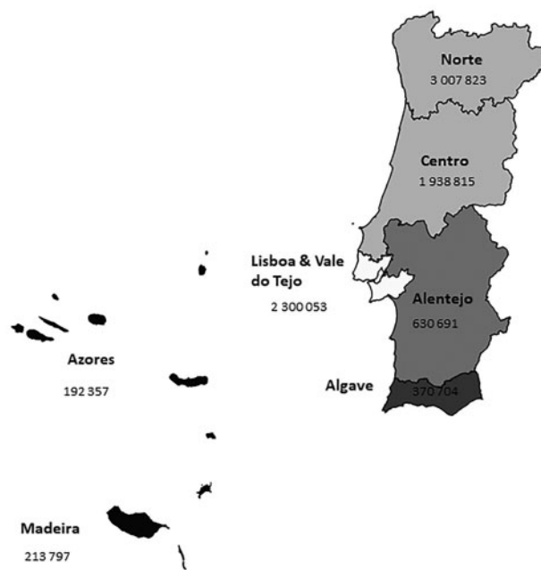
Figure 1. Portuguese population density distribution according to the 7 NUTS II.

Considering the primary aim of EpiDoC 1, the sample size was calculated based on the estimated prevalence of rheumatic diseases with a 95% confidence interval (CI), and