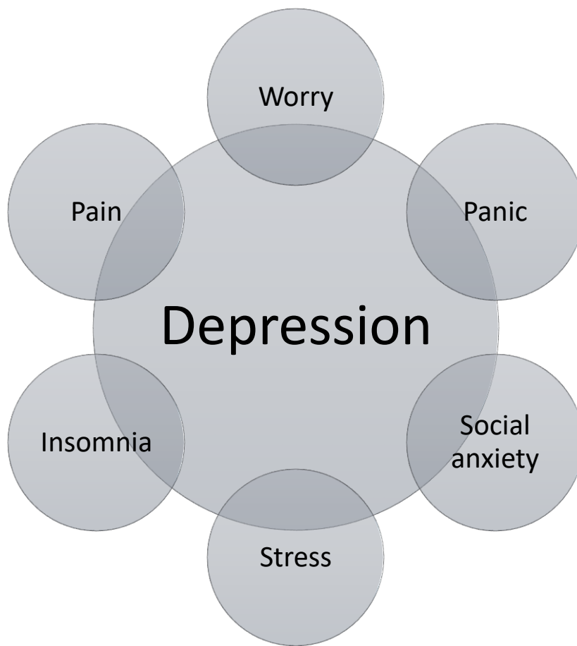
Figure 2. Depression and comorbid conditions. Schematic illustration on the relation between depressive symptoms and the symptoms of the other conditions assessed in the individually tailored internet-based treatment of this thesis. The size of the bubbles, or of the overlap with the depression bubble, does not represent the size of the comorbidities. In reality, the comorbid conditions also overlap each other.

problems facing the majority of patients with psychological complaints than we would be able to by using categorical definitions only. Figure 2 illustrates a population with depression and comorbid conditions.