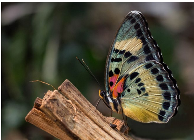
FIGURE 1 Euphaedra permixtum (Butler, 1873) is a fruit-feeding butterfly typical for many tropical forests of West and Central Africa.

Mount Cameroon is the highest mountain in West and Central Africa, rising directly from the seashore to its peak at 4,095 m a.s.l. It is located in the southwestern part of the Cameroon Volcanic Line (also known as Gulf of Guinea Highland), being the only active volcano in the region. Its slopes, excluding the eastern one adjoining the town of Buea, are covered by continuous tropical rainforests from lowland (often ~300 m a.s.l., although in some areas disturbed up to 700 m a.s.l.) to the timberline (~2,100–2,400 m a.s.l.), where the rainforest is replaced by montane and subalpine grasslands. Mount Cameroon is recognized as a hotspot of biodiversity and endemism for a wide range of taxa (Cronin, Libalah, Bergl, & Hearn, 2014), including Lepidoptera (Heppner, 1991; Maicher et al., 2016; Ustjuzhanin, Kovtunovich, Sáfián, Maicher, & Tropek, 2018; Yakovlev & Sáfián, 2016). The region is characterized by strong seasonality, mostly driven by the northward wet air movement during summer (monsoon), and the southward dry air movement from the Sahel during winter (harmattan) (Lefèvre, 1967). Annual precipitation usually exceeds 10,000 mm at the lower elevations of the southwestern slopes (making it one of the rainiest places in the world), with most of the rainfall concentrated between June and September, when monthly precipitation usually exceeds 1,500 mm (Lefèvre, 1967). Conversely, any rains between mid-November and February are rare, especially