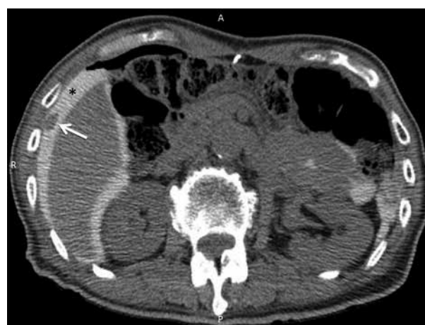
Figure 2. After hydrodissection, the nodule was identified as a peritoneal implant (white arrow). Black asterisk indicates hydrodissection fluid