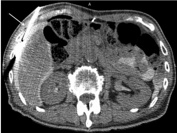
Figure 3. Axial CT image demonstrating microwave antenna (white arrow) in the peritoneal nodule. Microwave ablation was performed utilizing 40 W × 3 minutes