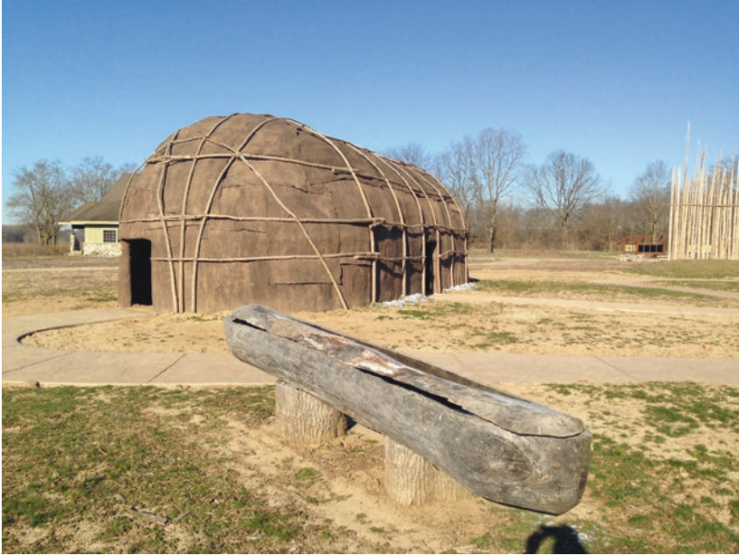
Fig. 12.2 Reconstructed Native American settlement with bent pole and bark-covered structures at Strawtown Koteewi, Hamilton Co., Indiana

authority (Adair et al. 2011), participatory heritage (Roued-Cunliffe and Copeland 2017), democratization of heritage (Coghlan 2017), and even decolonization (Atalay 2006; Lonetree 2012), government-controlled sites appear slower to embrace these trends. Some resistance may be attributed to the maze of mandated legal and bureaucratic rules in which government institutions operate, but an even more plausible explanation is that sharing control is predicated on questioning the established authority and fundamental principles of state-derived power, particularly in colonial settings. It strikes at the fundamental nature of the relationship between state authority and citizens, and it exposes contradictions between the espoused principles of a presumed “public heritage” and the realities of proprietary and neoliberal practices of government-owned sites.