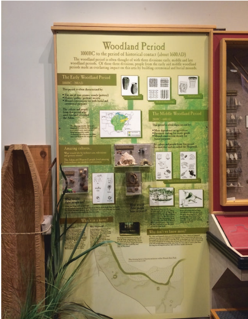
Fig. 12.3 Exhibit at the Mounds State Park Nature Center