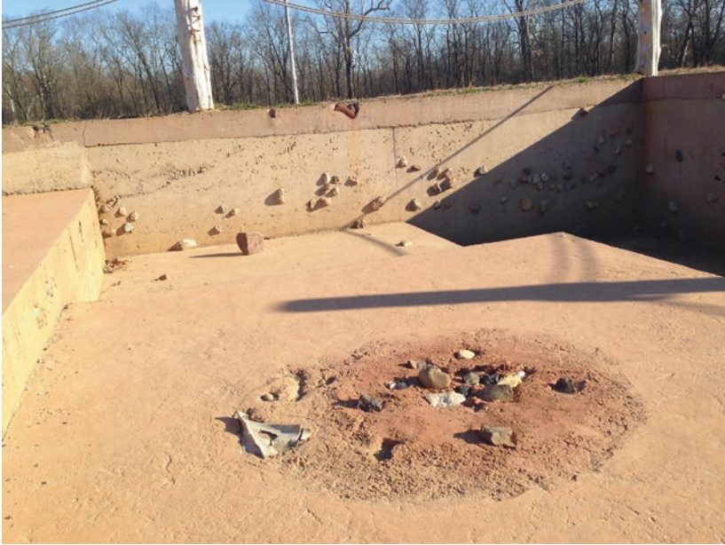
Fig. 12.1 Simulated 50 by 50-foot-poured concrete excavation at Strawtown Koteewi, Hamilton Co., Indiana

These cases raise several points that are important for broader investigation of government and heritage. The first is that the notion of “public heritage” needs to be disrupted. Save for rare exceptions, a heritage about which people are the most passionate is usually local, associated with places mostly meaningful to them as members of a relatively small group with well-defined ethnic boundaries and shared historical experience. Information about such heritage and the meaning and emotional responses it generates are often completely inaccessible to outsiders. Heritage is primarily experienced, understood, defined, and shared locally, but when archaeologists or other heritage specialists define heritage without collaboration with local groups it can be seen as colonizing as Smith and Waterton (2009), Zimmerman (2010), Harrison (2012), and others have argued. Furthermore, while heritage professionals and organizations have begun to implement the concepts of shared