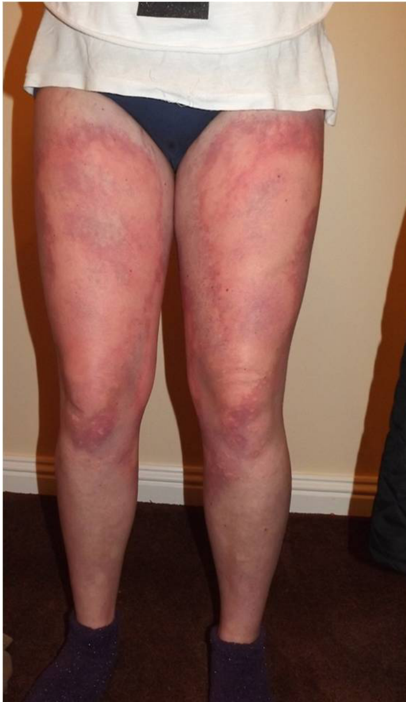
Figure 2 Diffuse rash precipitated by cold or damp environment in subject 4 diagnosed with familial cold autoinflammatory syndrome (FCAS).

syndromes, FMF, TRAPS, and MKD, revealed a heterozygous status for the MEFV E148Q polymorphism.