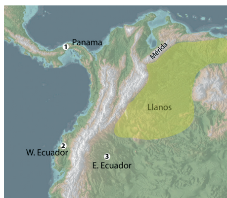
Figure 1. Primary collection sites in (1) central Panama, (2) Western Ecuador (Esmeraldas Province), and (3) Amazonian Ecuador (Yasuni National Park). Additional collections were made in Brazil, Peru, French Guiana, and Bolivia for some species. The Andes and the llanos region presently form a strong geographic barrier between lowland moist forests, east and west of the Andes. The uplift of the Merida cordillera occurred roughly at the Pliocene–Pleistocene boundary (ca. 2.7 Ma).

species span the heliophile–shade tolerance spectrum and the understory, canopy and emergent stature continuum, two key axes of differentiation among lowland rain forest trees (Poorter et al. 2006) (Table 1).