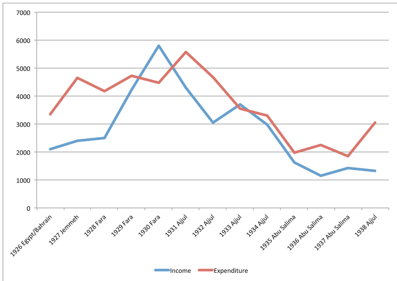
Figure 9: Graph comparing BSAE income against expenditure, 1926–1938

The problems actually began on the eve of Petrie's retirement, when he decided not to hold the 1933 annual exhibition (Drower 1995: 397), although some material was exhibited at the Anglo-Palestine Exhibition in Islington instead ( The Manchester Guardian 1933a: 8; 1933b: 8). The following year only photographs were exhibited as the authorities in Jerusalem had not yet released the project's allocation of finds ( The Observer 1934: 8; Petrie 1934: 15). This was to be the last of Petrie's London exhibitions and also marked the end of their numerous public lectures across England, as they made their final move abroad. Petrie was well aware of how dependent fundraising was on visibility, as he commented in a letter to Spurrell back in 1889: 'Out of sight out of mind, and I never expect to bulk so much in the public mind when silent [abroad] ... as when playing showman in London' (Petrie 1930c: 105). The consequences of this loss of visibility was that individual subscriber numbers declined, while the number of donors giving significant amounts also fell, from 21 in 1933, to 7 in 1934, then steadily down to a single major benefactor in 1938.