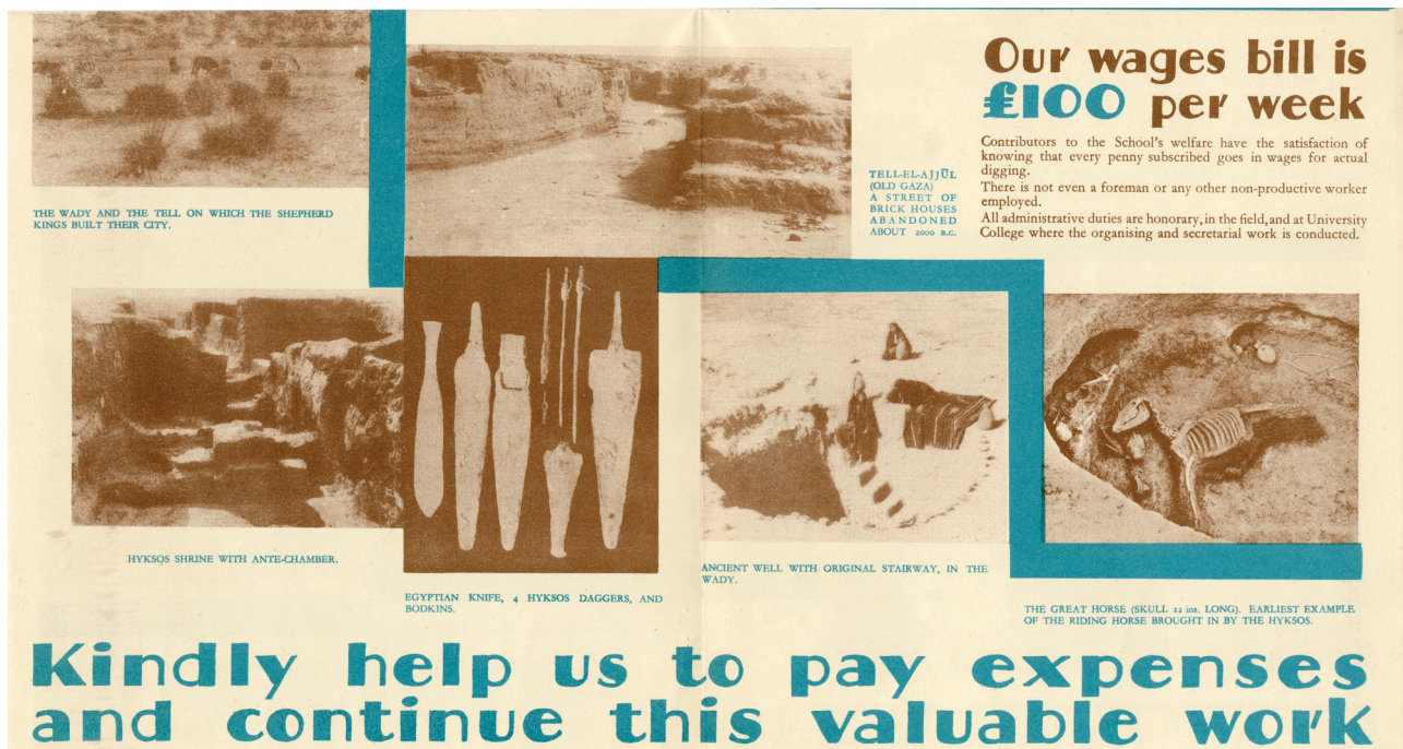
Figure 4: 1931 publicity flyer promoting the latest results from Tell el-'Ajjul with an appeal for further support