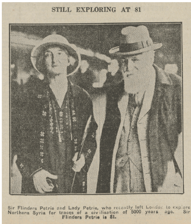
Figure 2: A regional newspaper in North Eastern Tasmania reports on the Petries' movements ( The Examiner 1934: 6).

which remained in the public domain, the end result of this practice was that material excavated by Petrie and his contemporaries became widely dispersed around the globe, with both British and International Museums taking advantage of this arrangement. The extensive networks that developed from this process also led to an increase in international publicity for Petrie's work (Figure 2).