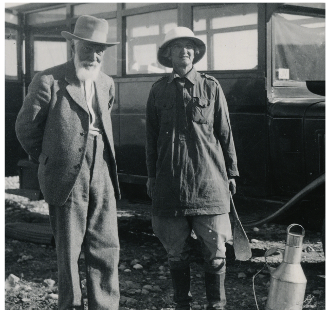
Figure 1: Sir Flinders Petrie and Lady Hilda Petrie stand in front of an old truck used to tour Syria in 1934

Despite receiving recognition for this success within his own lifetime, Petrie and Hilda's work was often overshadowed by the constant pressure of fundraising. Money was needed to carry out fieldwork, bring objects back to England and finance publication of their results. Over time additional needs developed, such as raising