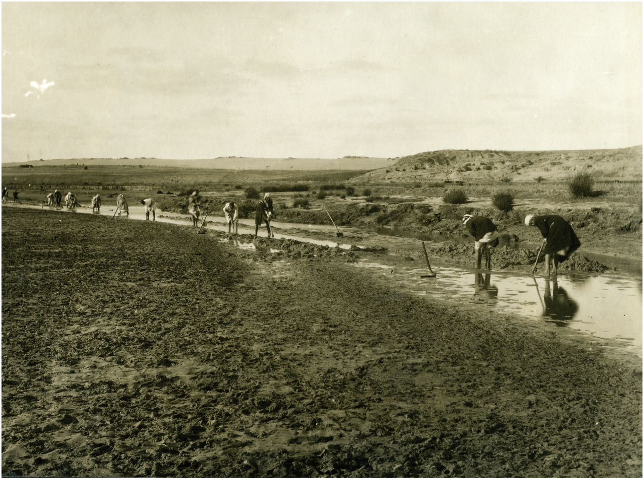
Figure 6: Workers hired by Petrie dig out a drainage canal near Tell el-'Ajjul

36 images were offered – falling into the expected format of 3 sets of 12 images, as was typical for stereoscopic sales at this time in general. The set was sold for 14 shillings; this would be equivalent to around £23 in modern money (The National Archives 2012; these and subsequent equivalency figures are based on 2005 values). These images were a mix of archaeological site views and digging shots, most of which contained people doing things – rather different from the more academic photographs Petrie preferred for his publications, where the features were the focus and people included only for scale. The exotic, foreign nature of the setting was emphasised by a good proportion of scenes featuring local Bedouin, while the captions were a mix of Egyptian and biblical references, such as ‘The wall of pharaoh Shishak’, ‘Tomb of Tutankhamen’s time’, ‘In the city of Rameses’, ‘Tracing defence of shepherd kings’ or ‘A modern Delilah at Shishak’s wall’.