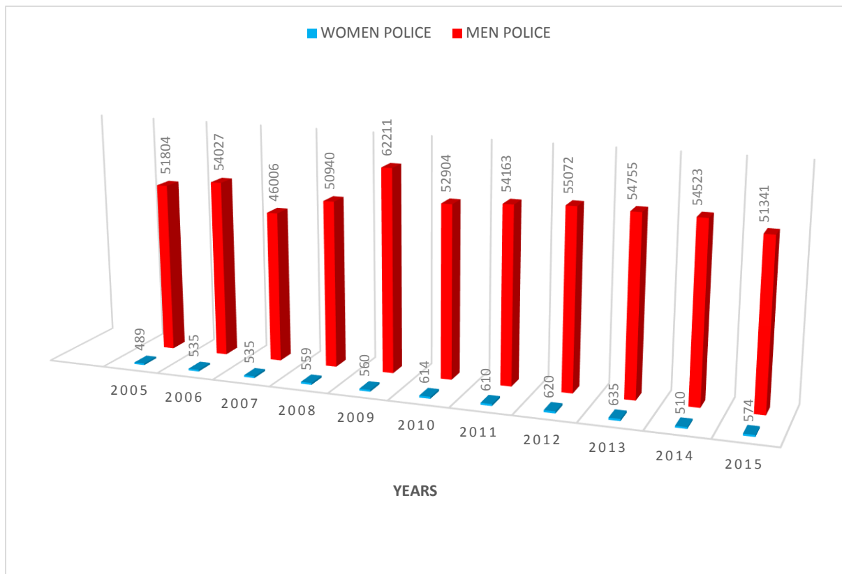
Table 4: A comparison of the representation of women against men in the Assam Police (civil + armed) 2005-2015

Head Constable, Naik and Constable). This means, there is no other rank at which women's representation has reached even 8%, much less 10%. Women are at their second highest representation at the rank of Sub Inspector at 5%, and then at Deputy Superintendent of Police at 3%. Only 1% of Assistant Sub Inspectors are women. And the rest of the ranks are at less than 1% - with 0.4% at Inspector General of Police, 0.3% at Additional Superintendent of Police, and the lowest at the rank of Inspector with 0.2%.