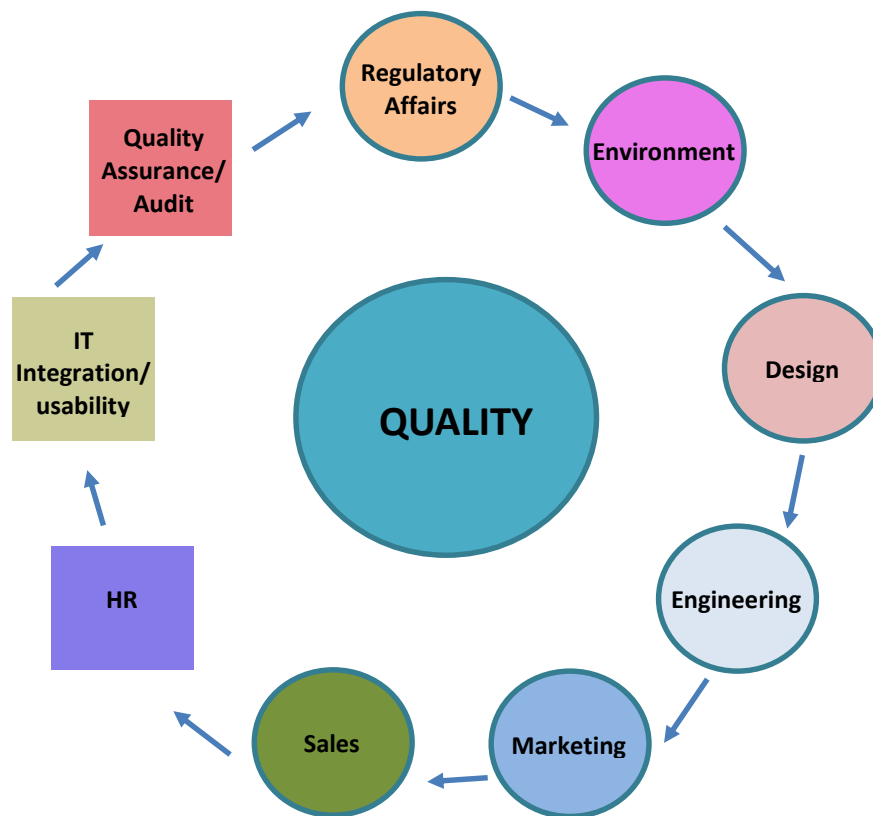
Figure 3: Compliance-Innovation Quality Loop

The implication is that a collaborative culture must be enabled through effective leadership, freedom to express doubt, and strong communication mechanisms to allow CIQL teams to achieve innovation while conforming to requirements (Holland et al. 2000; Lovelace et al. 2001). This allows cross-functional teams to engage more effectively throughout the Innovation Value Chain while also meeting sustainability goals, GRC requirements and budget targets. Collaborative environments also help overcome any inherent resistance to knowledge sharing as team members more readily share information and knowledge when they feel that it would be beneficial to the team’s common goal (Leonard and Sensiper 1998; Osterloh and Frey 2000; Gold et al. 2001).