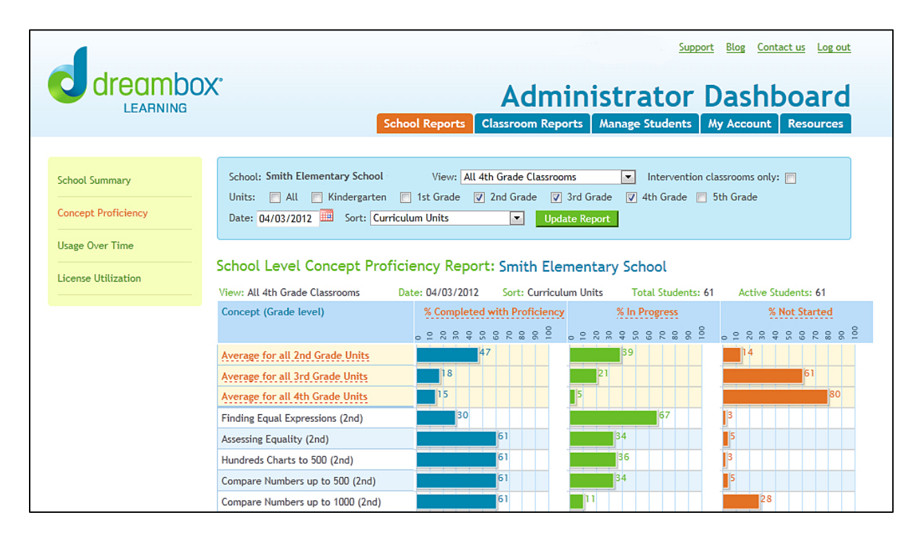
Exhibit 4. Administrator Dashboard Showing Concept Proficiency for a Grade Level

Researchers can use fine-grained learner data to experiment with learning theories and to examine the effectiveness of different types of instructional practices and different course design elements. Learning system developers can conduct rapid testing with large numbers of users to improve online learning systems to better serve students, instructors, and administrators. Researchers using online learning systems can do experiments in which many students are assigned at random to receive different teaching or learning approaches, and learning system developers can show alternative versions of the software to many users: version A or version B. This so-called "A/B testing" process can answer research questions about student learning such as: Do students learn more quickly if they receive a lot of practice on a given type of problem all