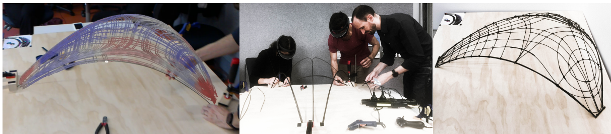
Figure 3: mixed-reality prototyping interface