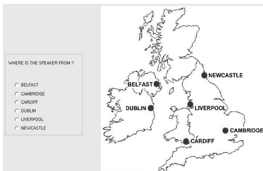
Figure 1. Screenshot showing the accent location map and forced choice list of cities

included six stimuli, one sentence from each target city produced by different speakers to those included in the main task. Listeners were instructed to associate the standard accent with Cambridge. The participants in both groups carried out the task in one session with a five-minute break. The task and instructions were administered by the second author who has an accent characteristic of the North East of England and had lived in London for three and a half years prior to this study.