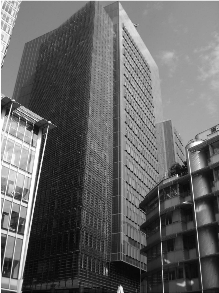
Picture 1. Ropemaker Place, London, EC2.

boiler, solar thermal and photovoltaic systems (PVs) to provide energy from renewable sources.