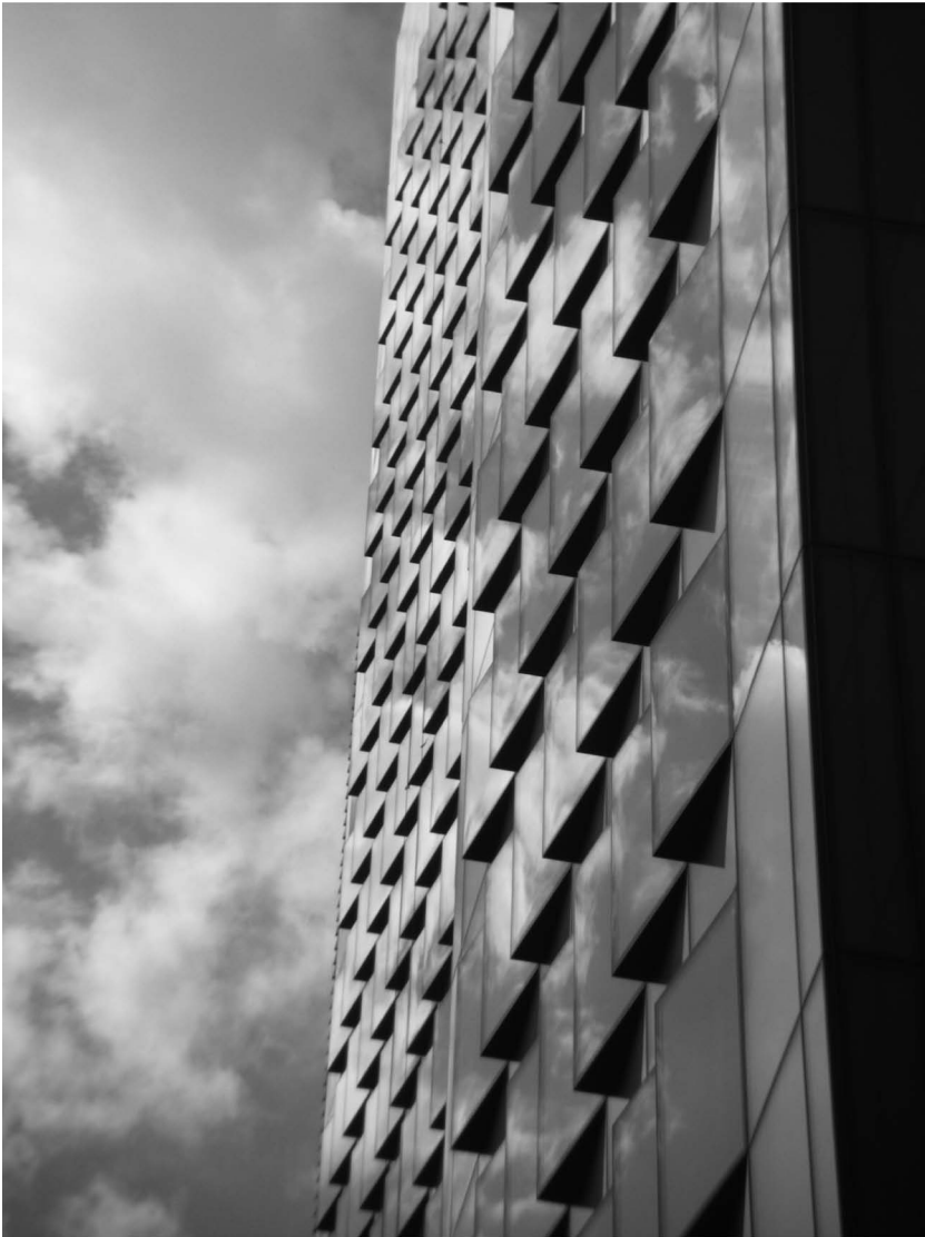
Picture 2. The façade of Ropemaker Place.

planning policy documents as intermediaries, the planning consent as an obligatory passage point, and the energy-modelling exercises as a form of black-boxing.