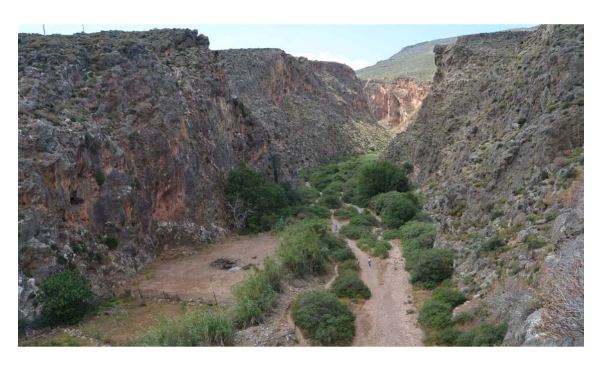
Fig. 3. Gorge of the Dead, strategically located near the Minoan palace at Kato Zakro, photo L. A. Hitchcock.

Historical accounts speak of pirates settling among and intermingling with local populations, forming new ethnic groups. Examples of this are found in the early 18th cent. CE, with persons from England, Greece, and Italy found among the Barbary pirates, who spoke a creole, the lingua franca, which remains poorly known (Mallette 2014). In addition, many converted to Islam, took Muslim names and settled in Africa (e.g. Rediker 2004, 31, 52-56; Earle 1970, 93). Thus cultural mixing was an outcome of becoming indoctrinated into pirate culture. Such mixing explains early Iron Age anomalies showing aspects of local and imported cultural packages existing together at Sea Peoples' settlements. A good example of this from Crete is the fenestrated Italian razor and Naue II sword similar to the one shown here, found at the post-palatial site of Kastrokephala (Kanta and Kontopodi 2011).