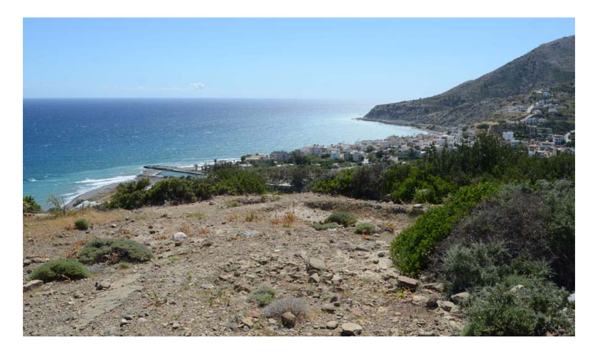
Fig. 2. Location of Myrtos-Pyrgos, strategically located overlooking the Pyrgos River Valley and the Libyan Sea, photo L.A. Hitchcock.

A similar purpose could have been served at Palaikastro Kastri on Crete, which Nowicki (2000, 50-52; 252; 2001, 29) has suggested may have been a lair for sea warriors, that is, pirates.