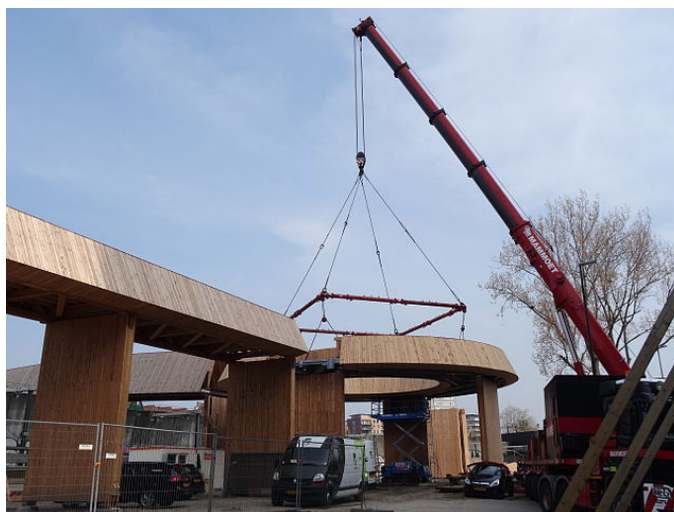
Luchtsingel bridge under construction.

development processes commercial secrets, innovators expose their ideas publicly, build their supply chains and engage with their customers in the early phases of development. In addition to the potential of crowdfunding as an alternative financing approach for start-up companies, it is also becoming popular among communities and local governments as a way of financing major public projects when government policy or funding fails to deliver what citizens desire. As a result, crowdfunding also signals a potential in facilitating institutional change in which power becomes more distributed, decisions on public spending become more democratised and participatory, and local governments develop their own 'business models' for increased self-reliance rather than relying on central government funding.