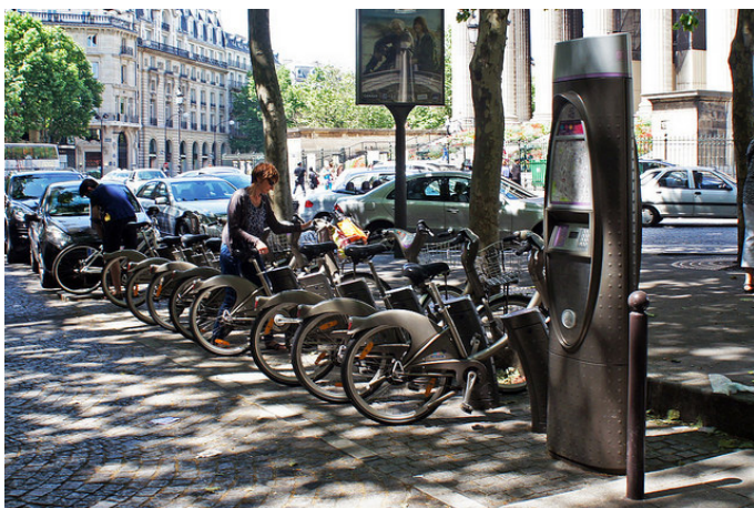
Paris bike share stand.

While all PSS represents a shift from product focus to system focus, only those based on delivering functional results to customers are promising in terms of shifting socio-technical systems, while the rest generate only marginal sustainability benefits (Tukker 2004). In functional PSS, the PSS provider promises to deliver a particular 'outcome' or meet a 'function', as shown in Box 2. Functional PSS is also referred to as function (or functional) innovation in eco-design terminology (Brezet 1997; Halila & Hörte 2006). Functional PSS applications not only challenge existing product concepts and consumption patterns through alternative ways of function fulfilment, but also give way