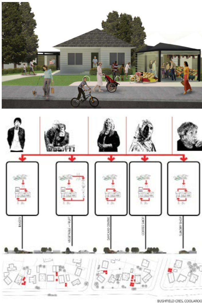
Neighbourhood Micro-Businesses. Image © Yee Hui Xuan, VEIL, 2010.

These changing dynamics in the business environment create a market risk for companies that do not develop strategies for aligning themselves with new systems approaches that could address critical environmental challenges, such as depleting resources, ecological thresholds, changing climatic, economic and demographic conditions (Gaziulusoy et al. 2013; Loorbach & Wijsman 2013; Rockström et al. 2009; Whiteman et al. 2013).