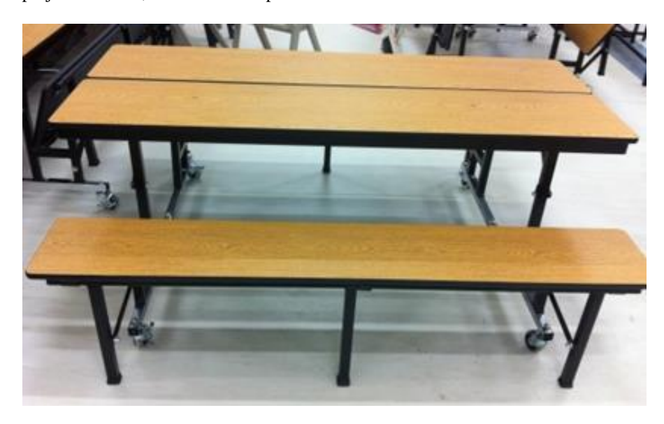
Figure 2. Table and bench units, as per the technical guidance document from the Department of Education and Skills (DES). Burrow College, March 2014.

documents of the Department of Education and Skills (DES), the space contained a stage, a mounted projector, table and bench units (see Fig. 1). These units were 1825 mm long with a seat height of 425 mm and a table height of 740mm. There were also hexagonal tables, chairs, a demountable stage (800 mm in height), a projector screen, acoustic sound panels and white walls.