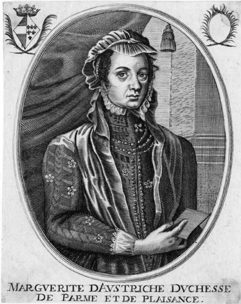
Margaretha van Parma (Margaret of Austria, Duchess of Parma and Plaisance), governor of the Netherlands, 1559–67 and 1578–82.