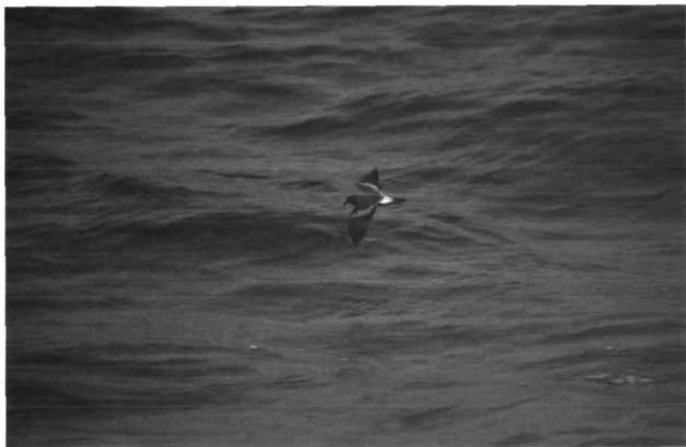
Leach's Petrel Vaal Stormvogeltje (C.J. Camphuysen)