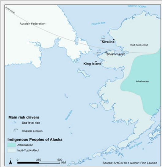
Fig. 18.3 Risk and Indigenous Peoples in Alaska

Forced relocation can lead to cultural damage, such as loss of traditional livelihoods (Lynn and Donoghue 2011). It is hard to put a price to cultural loss, but efforts have been made to maintain the culture and traditions of Kivalina residents, despite relocation. This is done, for example, by creating projects that enable the communities to share thoughts about local ways of life and locate, connect and educate new relocation partners and networking with global community to shape the discourse on climate displacement (see: www.relocate-ak.org ).