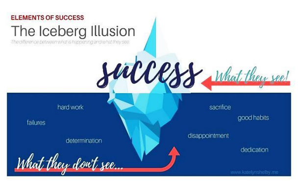
Fig 2. The Iceberg Illusion

dedication, good habits and persistence are not visualised at the time of achievement. Every goal setter will undergo this extensive venture to get