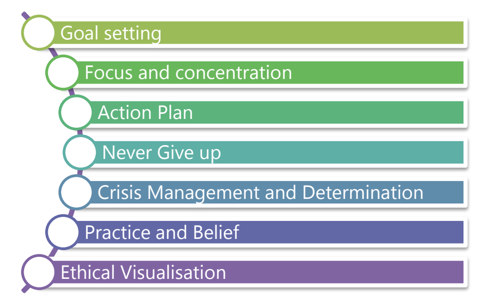
Fig 1. Important Keys of Success

Inspiration: Gather a set of successful great personalities you admire and follow their principles that drove them into success. Read a lot about the inspired personality listen and observe the positive thoughts about them in your day to day life. Follow those master plans to achieve success. We will follow the map of others to accomplish success in life.