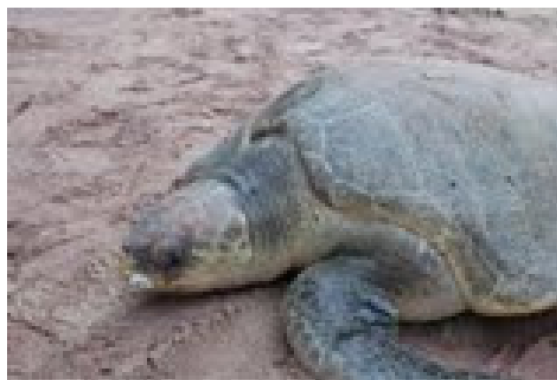
Fig. 1. Closure view of the green turtle at Pamban

The presence of one female green turtle (Fig. 1) along with its nest were reported on the sandy beach of Pamban landing centre along the GOM on 15-01-2011 (from 05.10-06.20 hrs) (Fig. 2). Shore and near shore water of the GOM were calm. Local enquiries revealed that it laid eggs at 04.30 hrs. The nest was filled with eggs. The position of the nesting pit was noted. All the eggs were removed and counted by excavating the nesting pit with the help of Forest Department staff who were already present on the spot (Fig. 3). The nest was excavated and the depth of the nest from surface to the bottom was measured (Fig. 4). To protect from natural predators, the eggs were safely transferred and buried in pits for incubation in a beach hatchery by the Department of Forests, TamilNadu. To determine the egg size, twelve eggs randomly collected at the time of translocation were