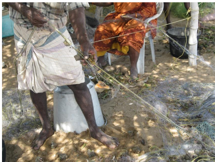
Figure 6 Net operated in seagrass meadows near Thonithurai, Mandapam showing the catch.