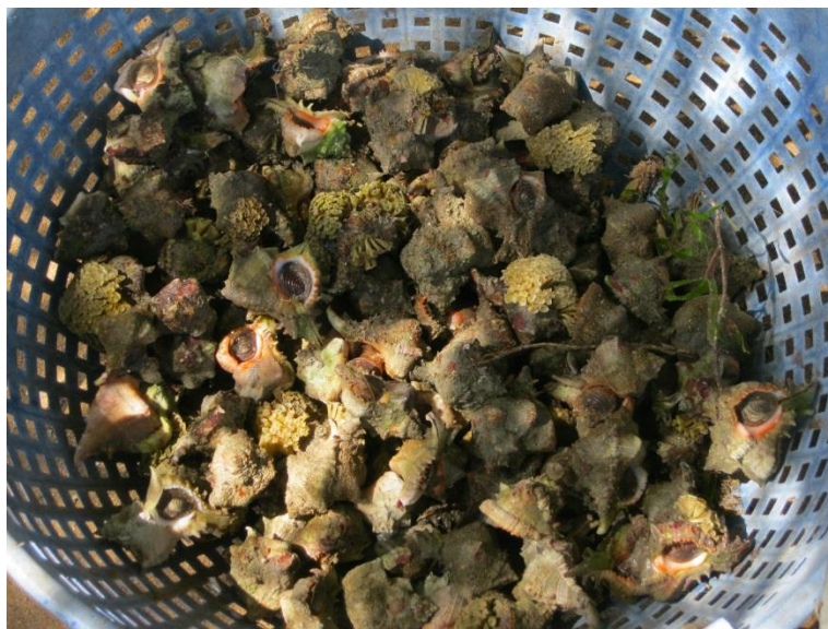
Figure 5 Catch of Murex vergineus from Seagrass meadows