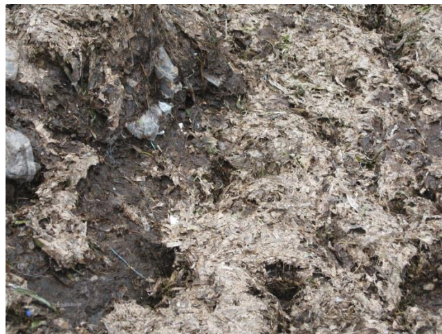
Figure 4 Huge quantity of seagrass leaf litter piled in the shore near Maraikayar pattinam, Mandapam